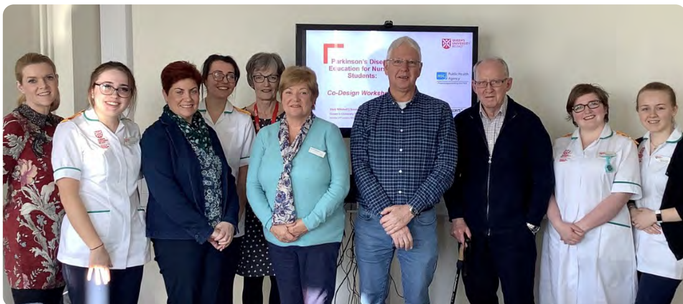
Members of the Parkinson's Disease podcast co-design team

Following on from these questionnaires, the team co-designed an interview guide which sought to explore how the audio podcast had influenced student practice in the six months after listening. Four focus groups comprised of a total of 35 nursing students took place. Using thematic analysis, three main themes emerged. The first theme was that the audio podcast helped students to empathise and better understand the lived experiences of people living with PD. In this theme, students noted their surprise around the fluctuation