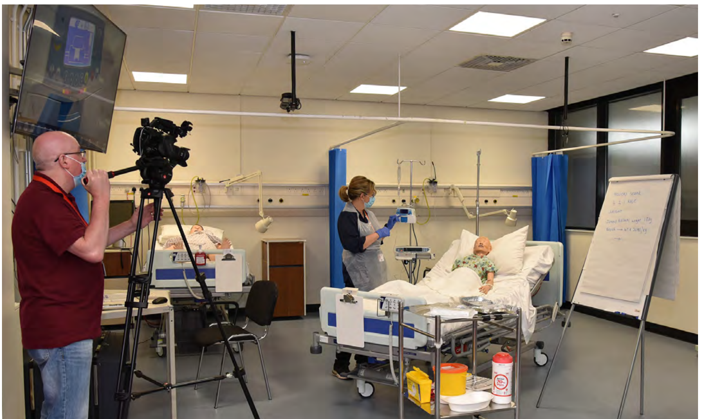
A live-streamed workshop

Blended learning, flexible learning, independent learning and flipped classrooms are not new concepts within education, and the September 2020 curriculum was visioned as, and underpinned with, a blended learning approach. However, the move to a substantive remote, virtual learning model of delivery, within a very limited timeframe was not something that was anticipated when the curriculum was developed, and thus the need to provide impactful learning and engagement to support each student's development from professional, theoretical and practical perspectives has been at the forefront of our work in the last 16 months. The commitment, desire, and professionalism of the staff to deliver meaningful learning experiences and activities has required the acquisition of new skills and ways of working, both individually and collaboratively, to meet these needs