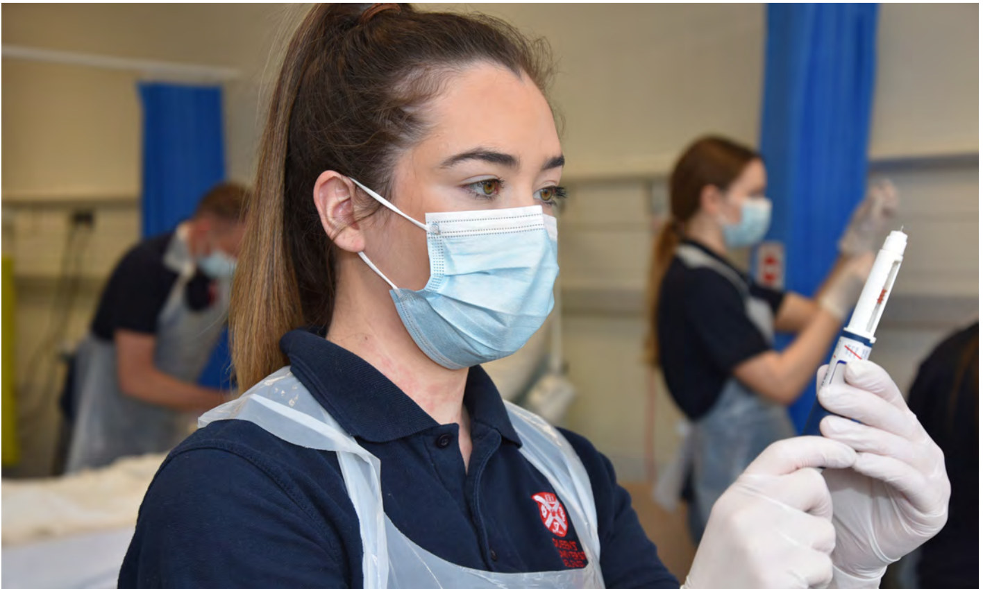
Students practising essential skills in lab

and to progress with delivering the validated programme of study.