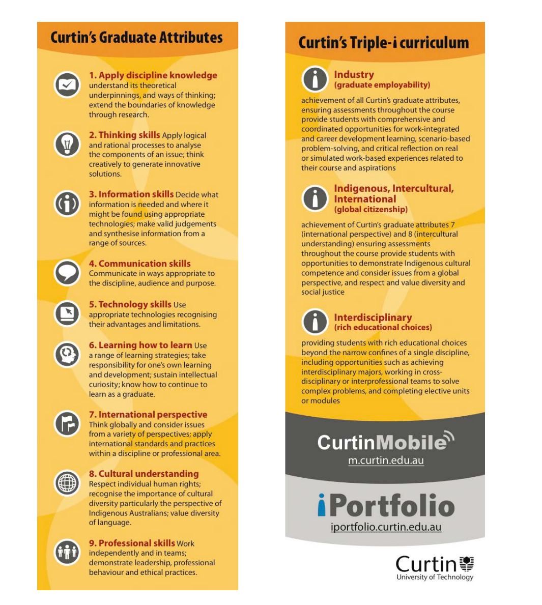
Figure 1. Bookmark describing Curtin University's Graduate Attributes and the Triple-i curriculum