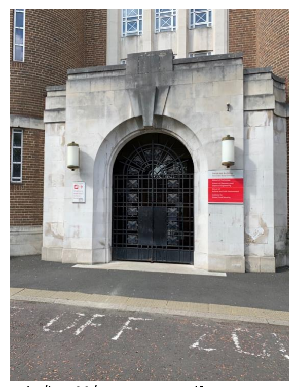
Full map available: http://www.qub.ac.uk/puremaths/btm30/campusmap.pdf