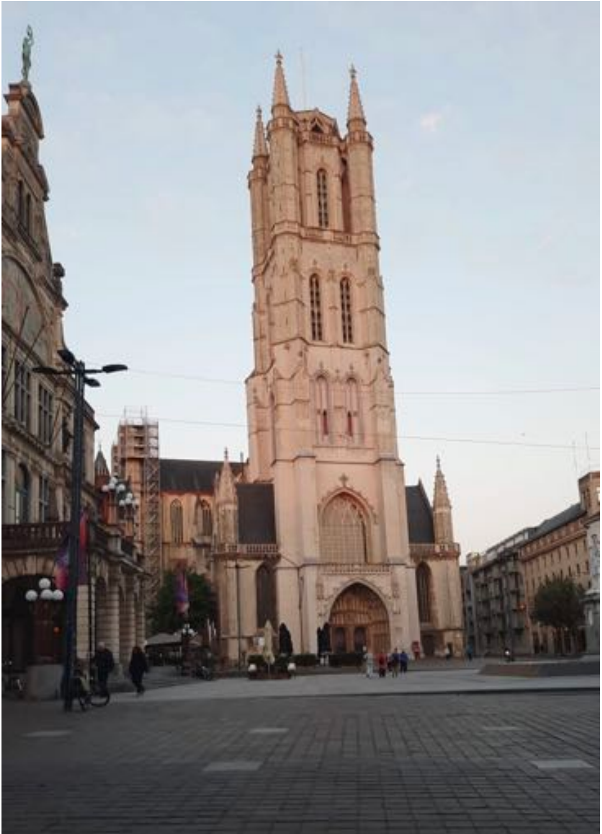
Saint Bavo's Cathedral, Ghent