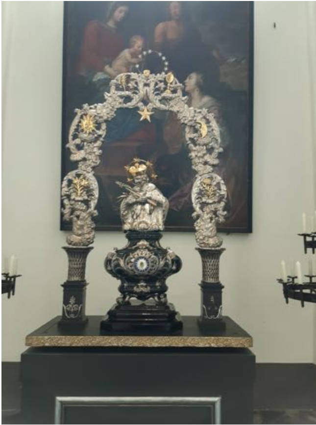
Ornate Reliquary, Church of Our Lady, Bruges