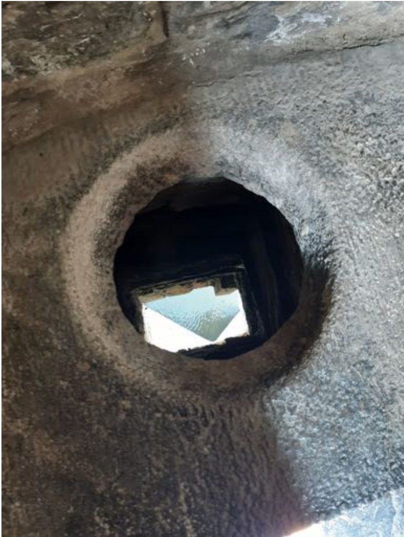
Medieval Toilet Plumbing in Gravensteen Castle, Ghent: Straight into the Moat!