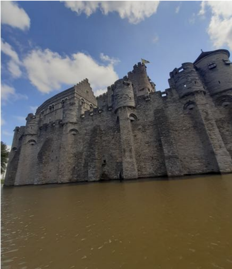
The Moat that Surrounds Gravensteen Castle, Ghent