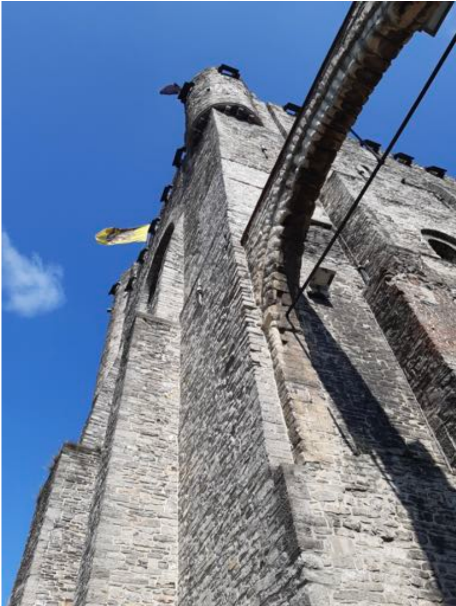
Entrance into Gravensteen Castle, Ghent