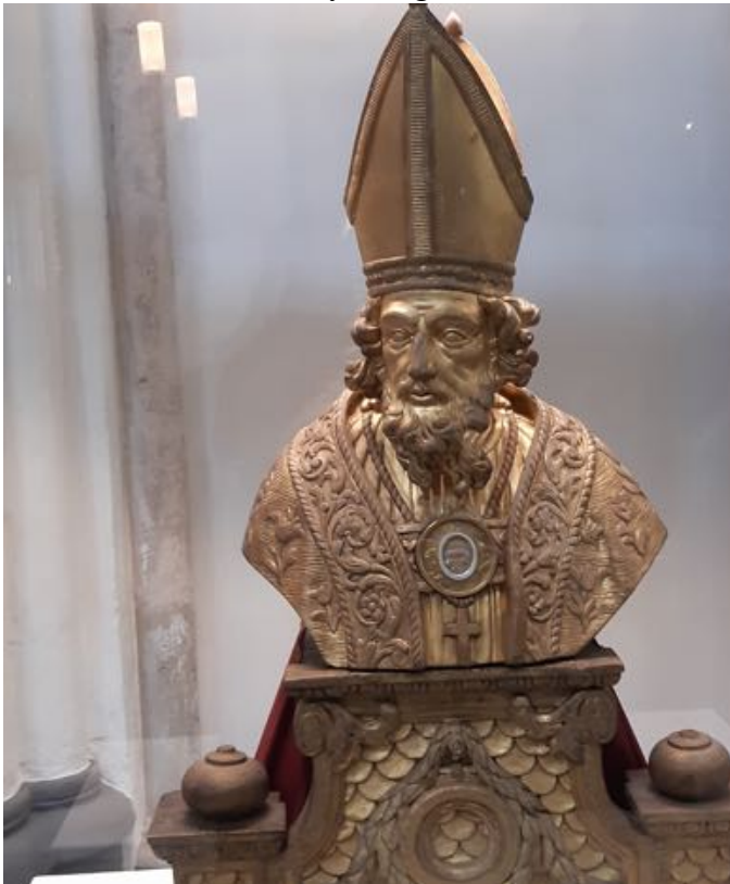
Gilded Reliquary, Church of Our Lady, Bruges