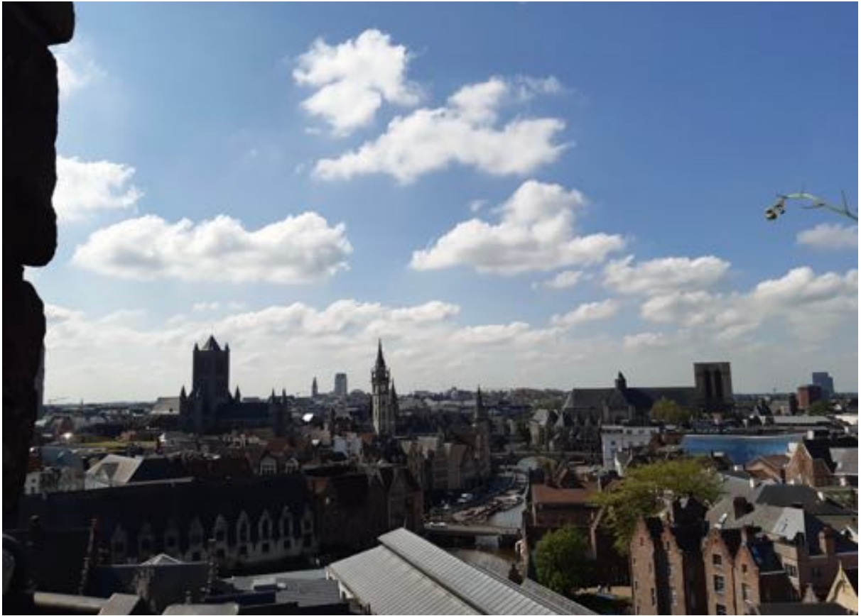
Spectacular Views of Ghent from the Top of Gravensteen Castle