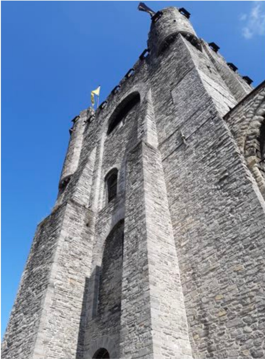
Walls of Gravensteen Castle, Ghent