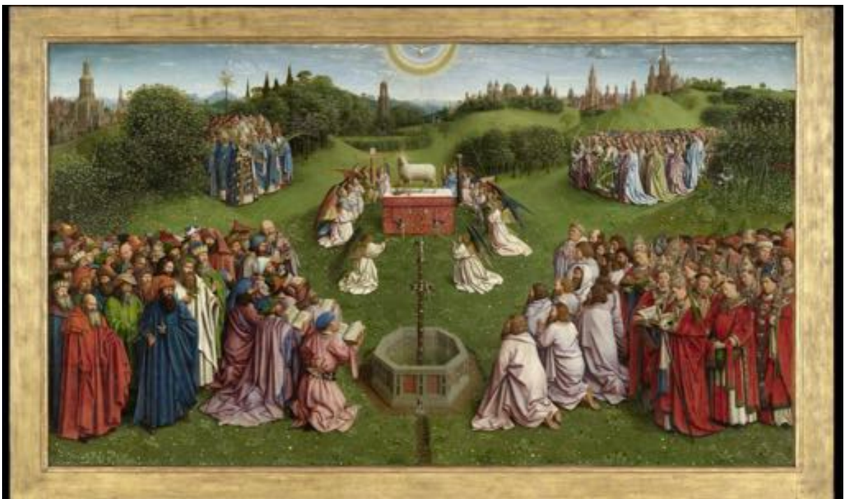
Detail of Jan Van Eyck's Ghent Altarpiece in Saint Bavo's Cathedral, Ghent