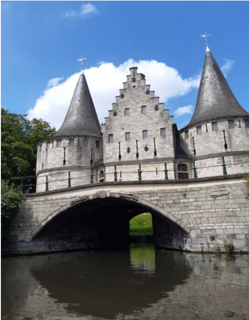
Medieval Gates, Ghent