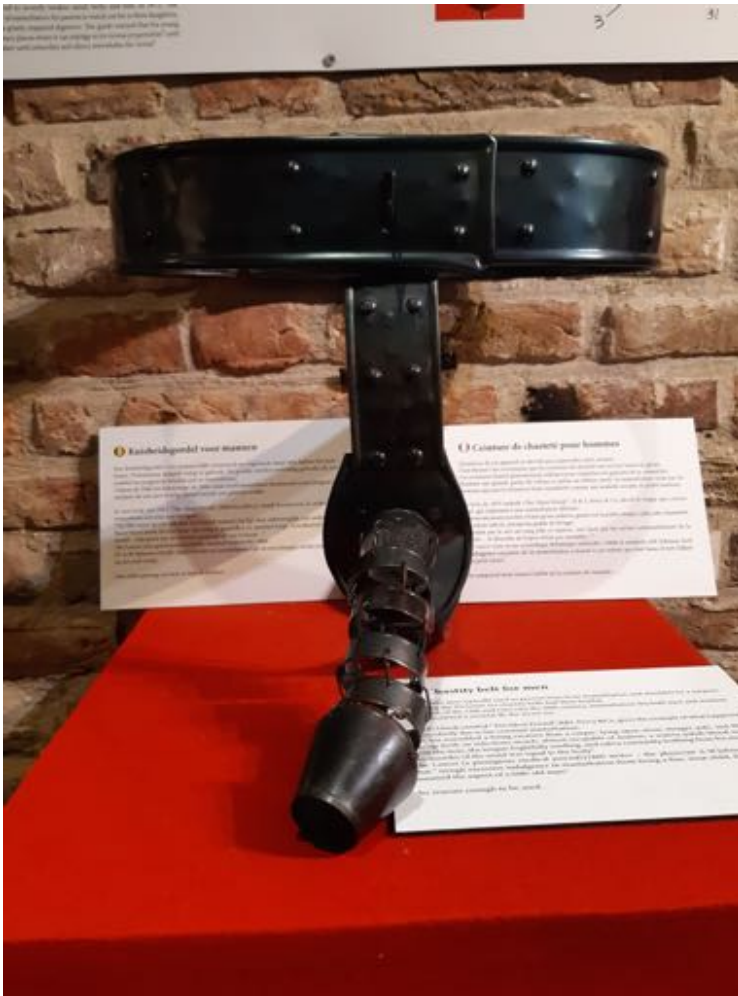
Medieval Male Chastity Belt at the Torture Museum, Bruges: Medieval Fashion Takes 'Protection' to a Whole New Level!