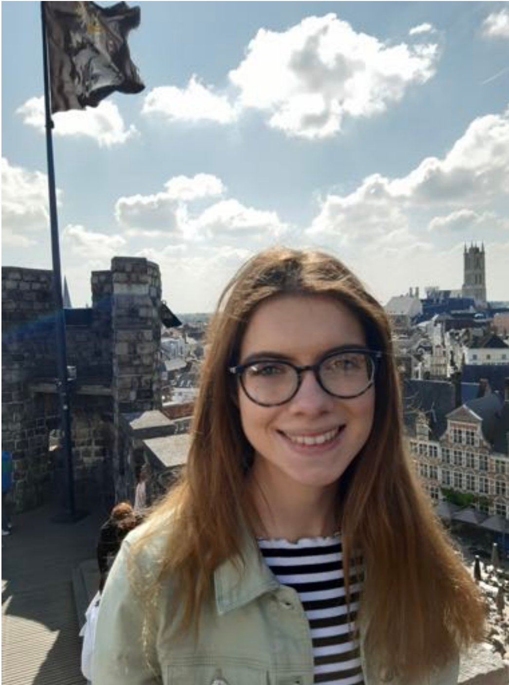
MA Student, Victoria, Surveys Ghent Cityscape