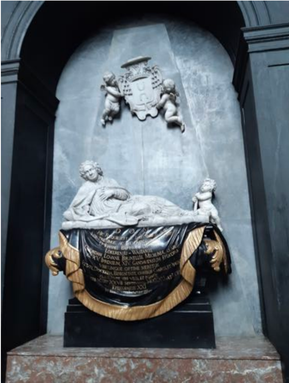
Transi Tomb in Saint Bavo's Cathedral, Ghent