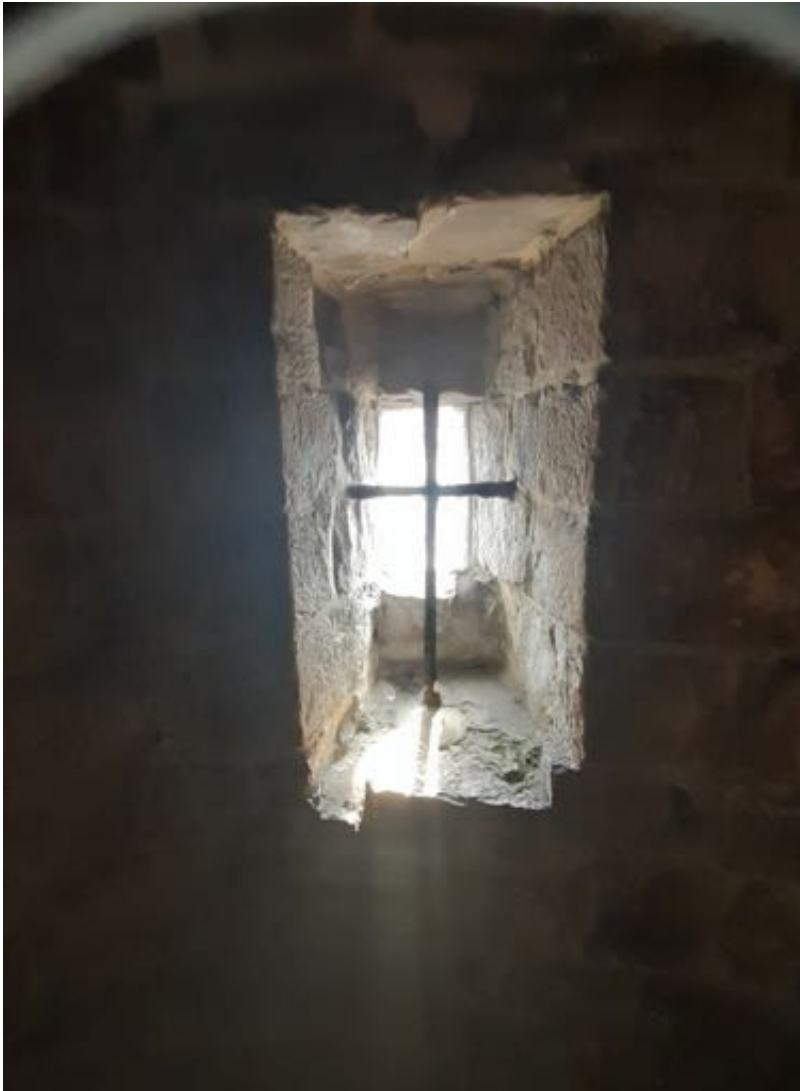
Crucifix Window Inside Gravensteen Castle, Ghent