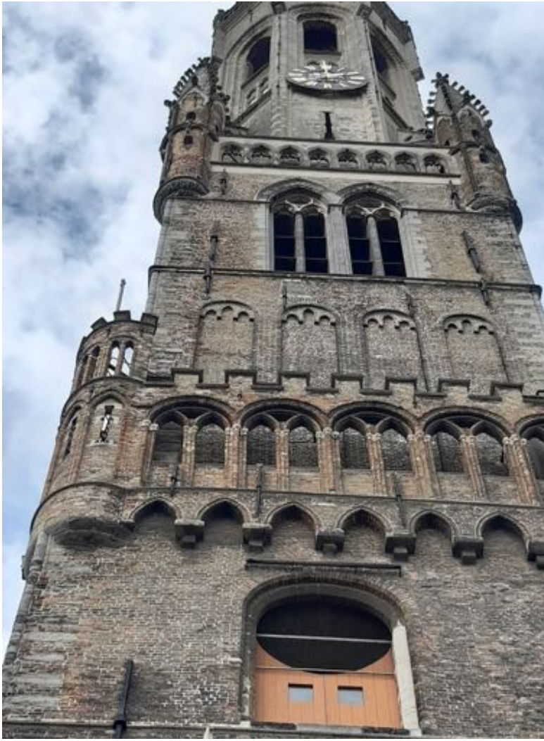
The Medieval Belfry in Bruges