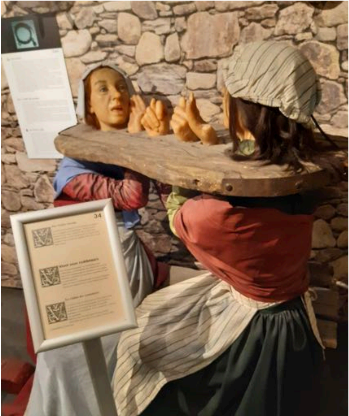
Medieval Torture Museum, Bruges. When Gossip Backfires: Medieval Invention Ensures Women Stick Together, Even When They'd Rather Not!