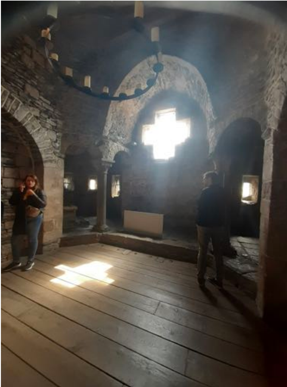
Medieval Chapel in Gravensteen Castle, Ghent