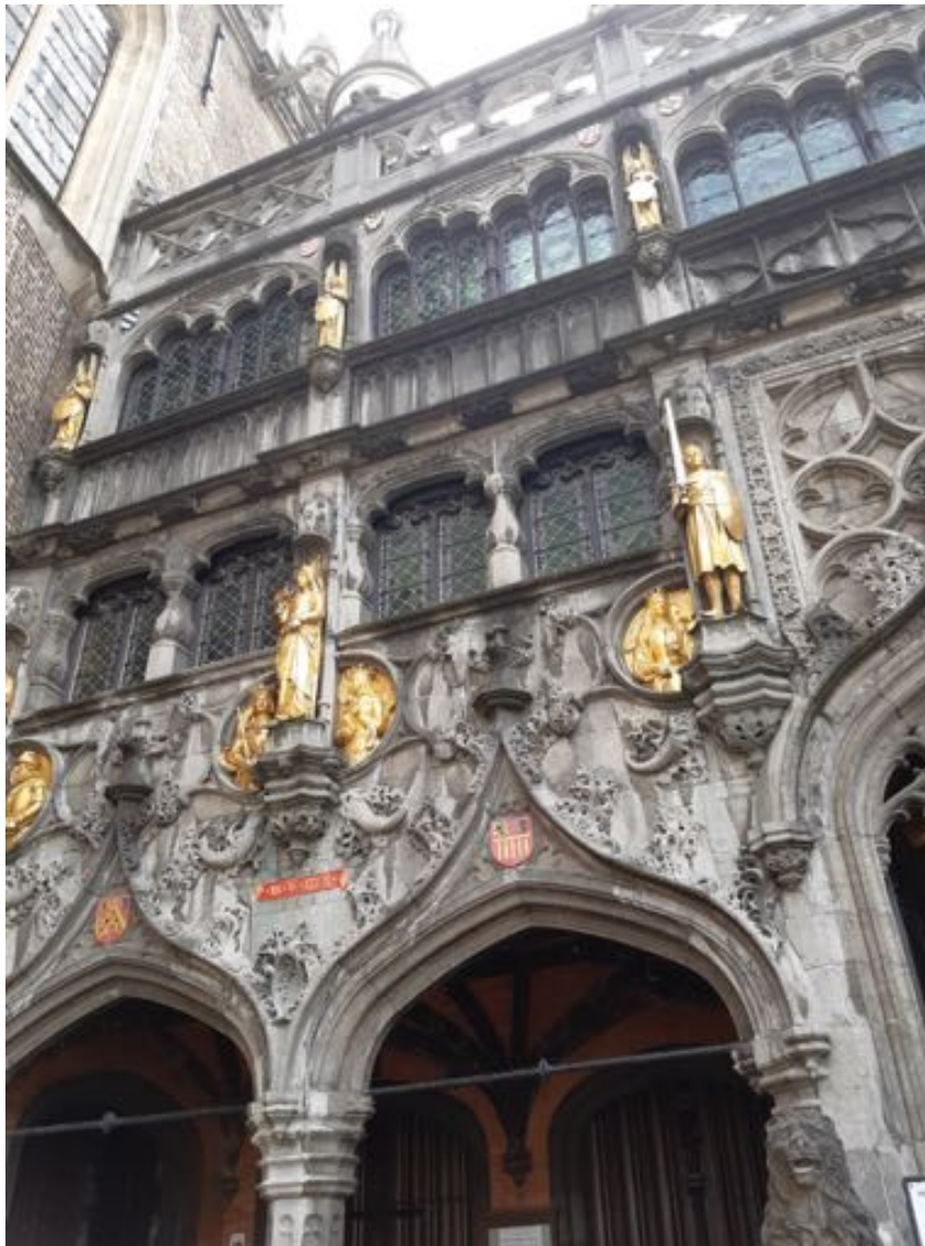
The Church of the Holy Blood, Bruges

Students also visited the Basilica of the Holy Blood and knelt before the watchful priest who guards the relic of Christ's blood.