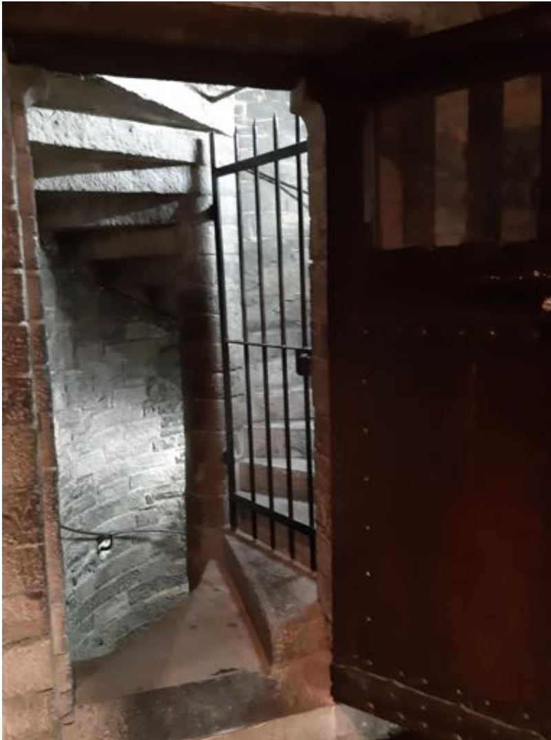
Stone Stairwell in Gravensteen Castle, Ghent