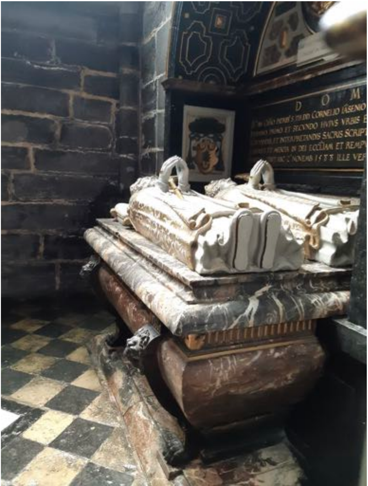
Transi Tomb in Saint Bavo's Cathedral, Ghent