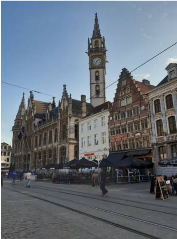
The medieval city of Ghent

As part of their medieval studies, postgraduates in the School of English participated in a trip to the medieval towns of Ghent and Bruges, in Belgium. Both cities were important centres of commerce throughout the middle ages and are therefore replete with fascinating buildings, monuments and artefacts that afford a unique insight into the lives of ordinary people.