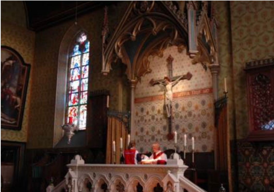
Priest Guarding the Relic of the Holy Blood of Christ, Bruges

The medieval monuments in Ghent were equally spectacular. Students toured Gravensteen Castle, where they saw the stone toilets that empty into the moat below via a carved hole. After their trek, students relaxed by taking a boat cruise along the castle's moat and canals, towards the last of the city's preserved medieval gates. Finally, the trip culminated with a visit to St. Bavo's Cathedral, where they saw Jan Van Eyck's monumental Ghent Altarpiece—one of the most celebrated (and beautiful) artworks of the entire middle ages.