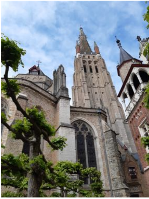
The Church of Our Lady, Bruges