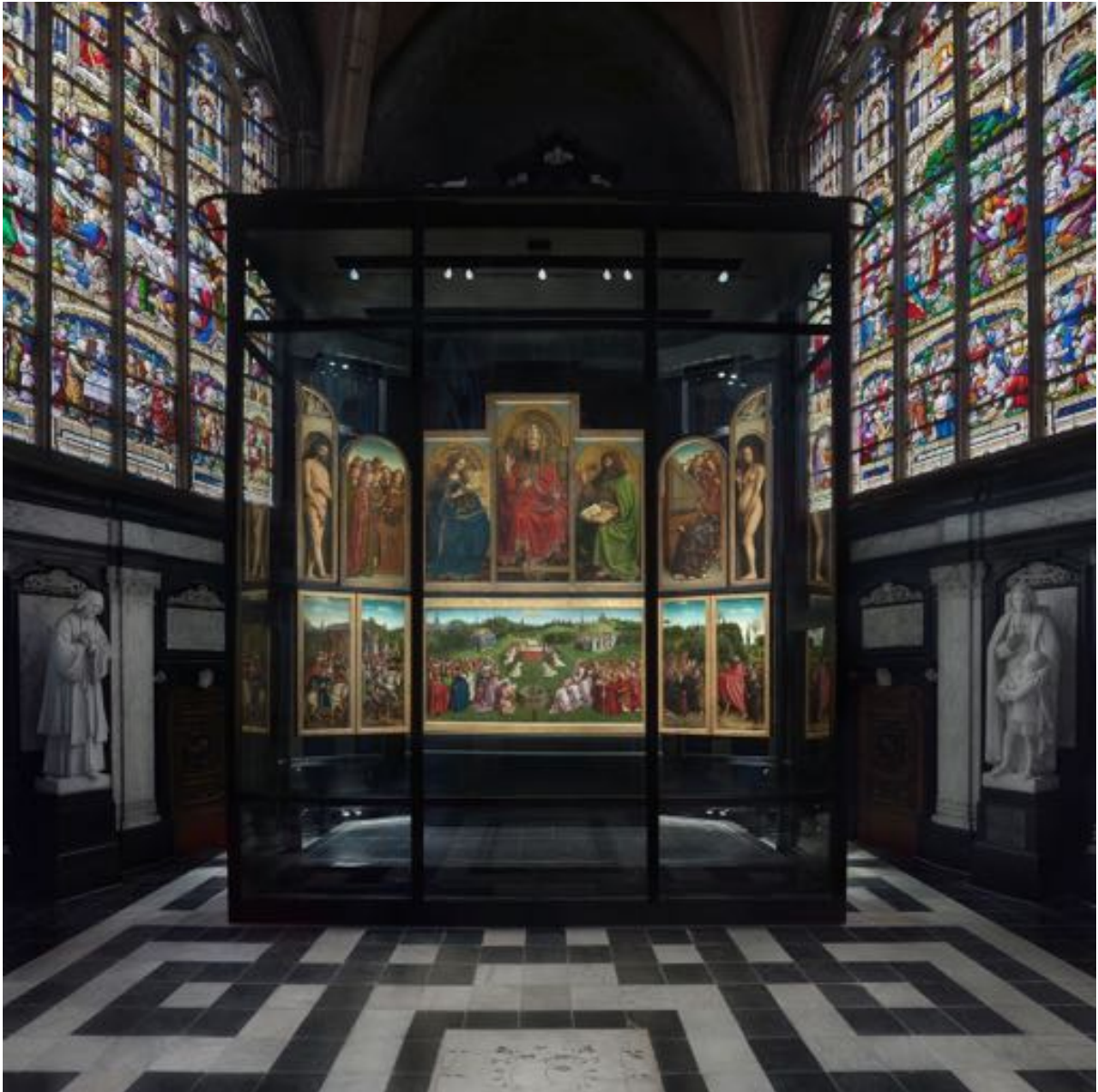
Jan Van Eyck's Ghent Altarpiece in Saint Bavo's Cathedral, Ghent