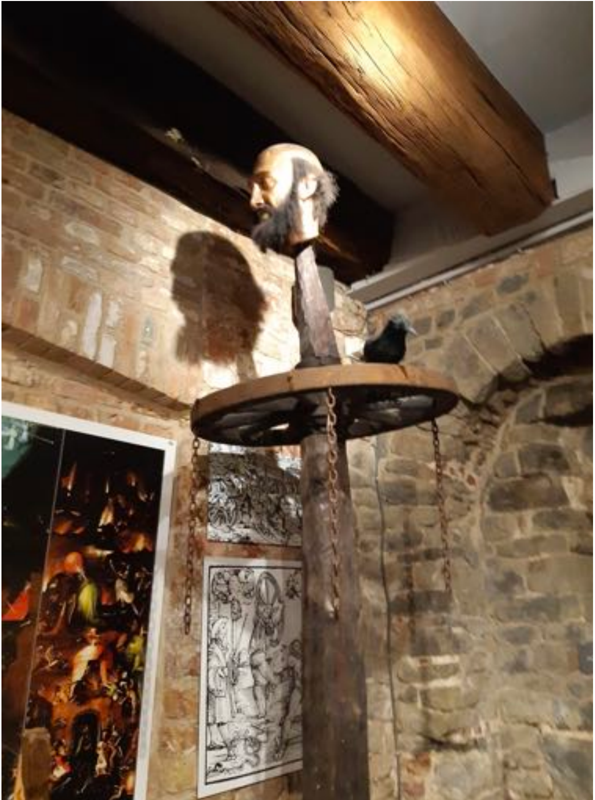
A Head-Turning Experience at the Medieval Torture Museum, Bruges