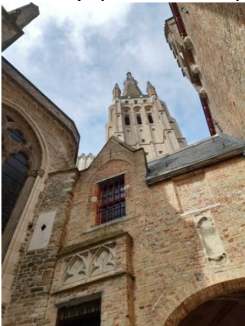
Church of Our Lady, Bruges

The students then scaled the city's enormous Belfry where they saw (and heard!) the complex mechanisms that allow enormous bells to ring out various tunes.