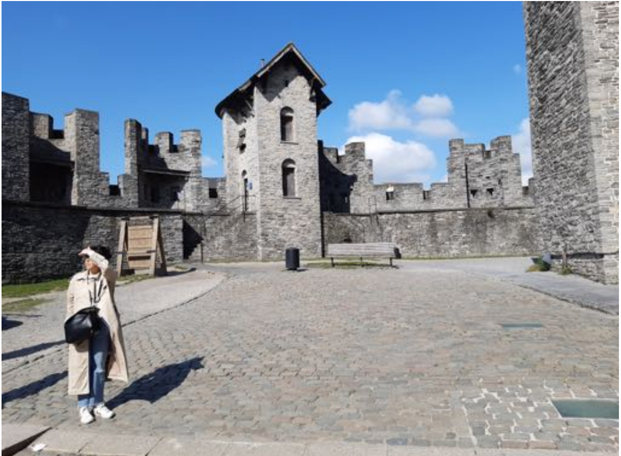
The Courtyard of Gravensteen Castle, Ghent