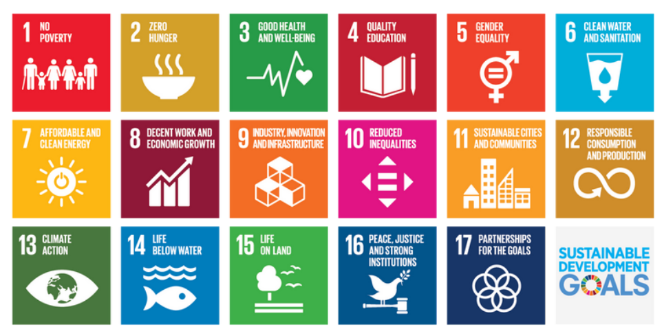
Figure 2: The UN SDGs

ESG [4] is a generic term used in capital markets, which refers to the environmental, social, and governance factors when evaluating a company's sustainability impact and future performance. With the growing awareness of sustainable development, more and more investors tend to become socially responsible and consider companies' ESG performance in their decision-making. This interest in ESG investing leads to a great demand for ESG data and the proliferation of ESG agencies, ratings, rankings, and other products (Abhayawansa and Tyagi, 2021). Consequently, ESG investing is becoming mainstream. Moreover, the COVID-19 pandemic has amplified this momentum (Abhayawansa and Tyagi, 2021), with the number of ESG-related investment funds growing rapidly in the past two years and expected to continue rising in the next decade. With "SDGs" and "ESG" increasingly becoming top trends, "CSR" seems to be less frequently mentioned nowadays.