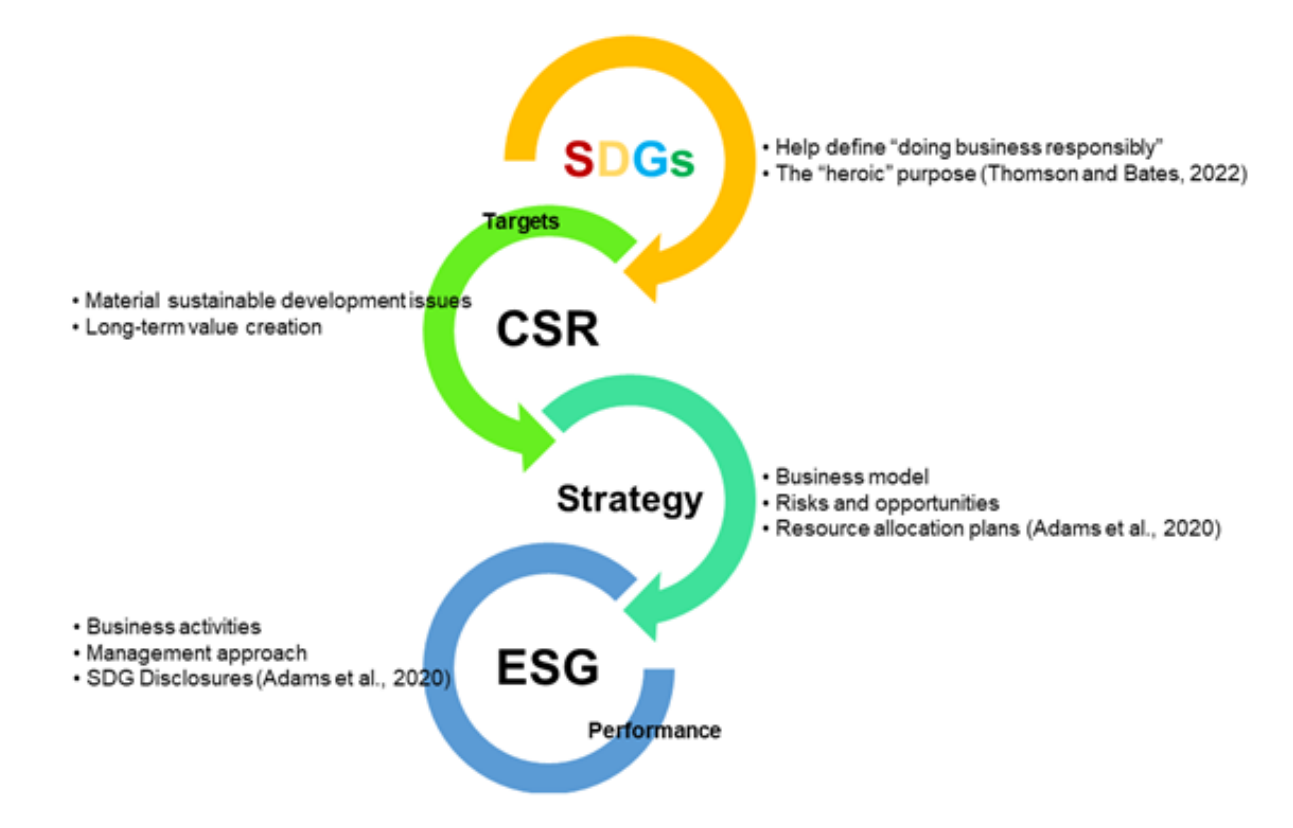
Figure 3: CSR: A Broadened Concept

CSR may seem like an old-fashioned term nowadays and will eventually be replaced by other trending terms/acronyms. However, the conceptualisation of responsible business does not cease. With growing awareness of the interconnections between people, the planet, prosperity, peace, and partnership, our understanding of CSR continues advancing. The recent prevalence of the SDGs and ESG reflects that our perspective on CSR has been broadened – beyond profit, compliance, ethics, and philanthropy – to include long-term value creation and sustainable development. Importantly, the SDGs have helped define the meaning of "doing business responsibly" by translating it into 17 goals (broken down into measurable targets) (Thomson and Bates, 2022). They become a new consensus, language, and "heroic" purpose for all organisations, including businesses (Thomson and Bates, 2022, p. 3).