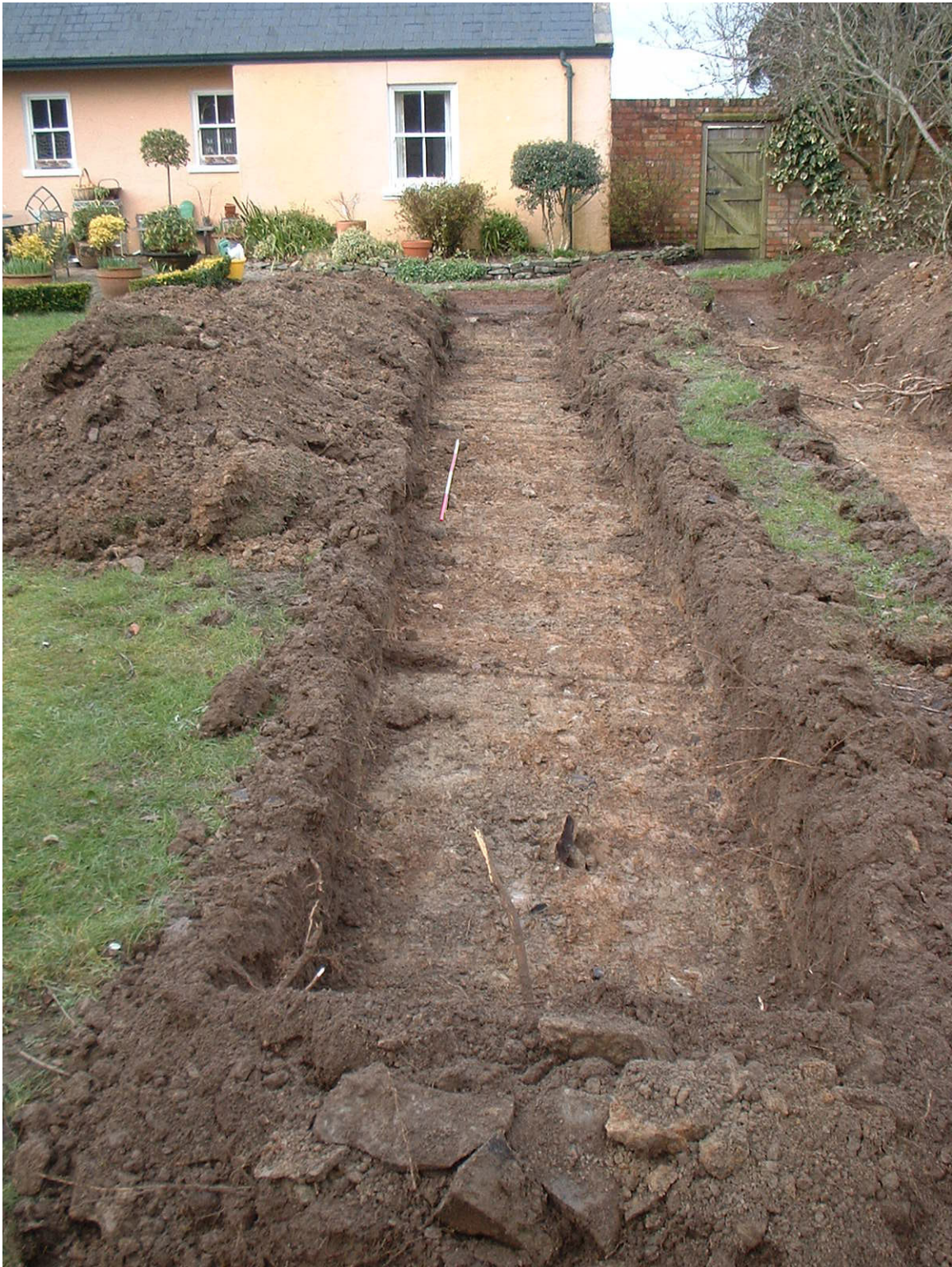
Photo 3: Trench 2 after excavation showing surface of subsoil (202).