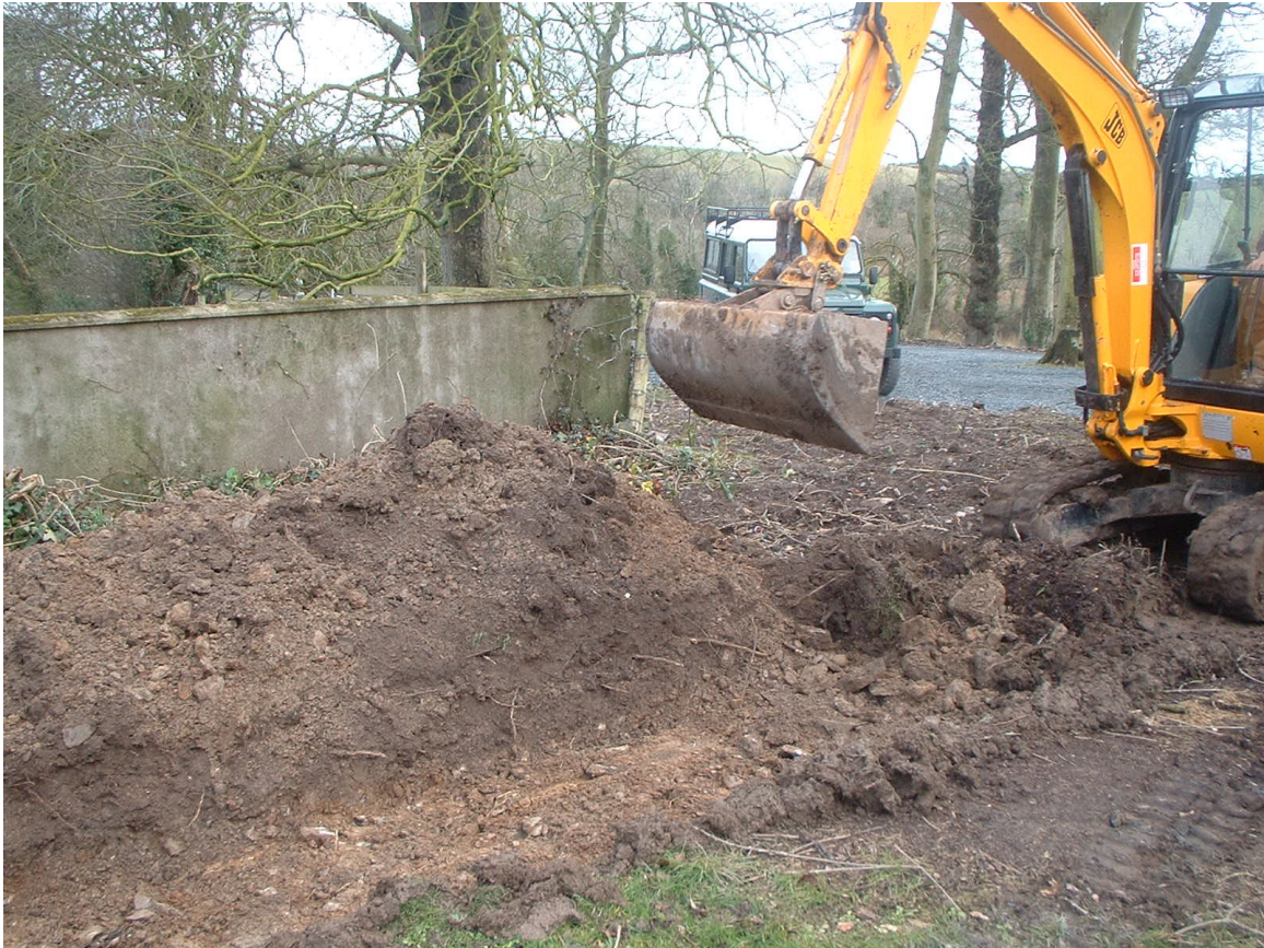
Photo 1: Excavation of Tr. 1 showing utilization of toothless “sheugh” bucket.