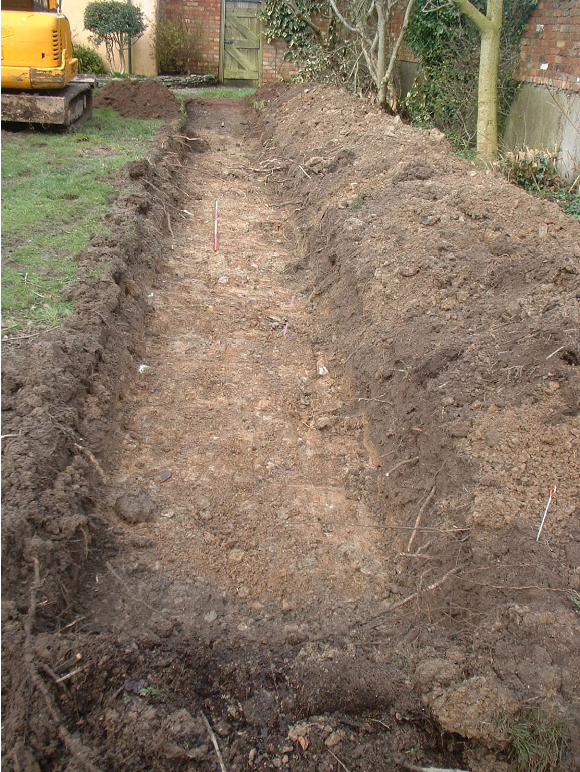
Photo 2: Trench 1 after excavation showing surface of subsoil (102).