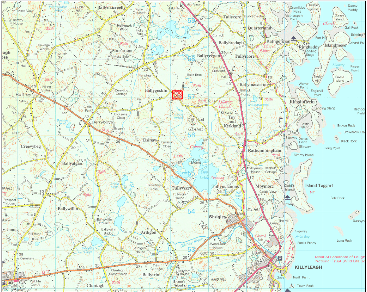
Figure 1: Location of site.