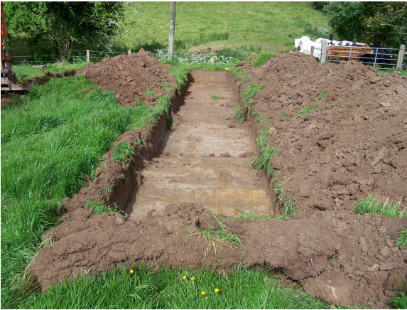
Plate 1: Trench 1, looking west.