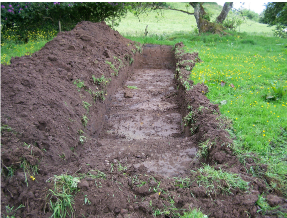
Plate 5: Trench 5, looking north-west.