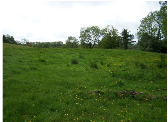
Plate 6: View of rath, looking east.