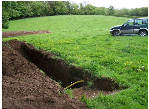
Plate 4: Trench 4, looking north-east, showing part of rath.