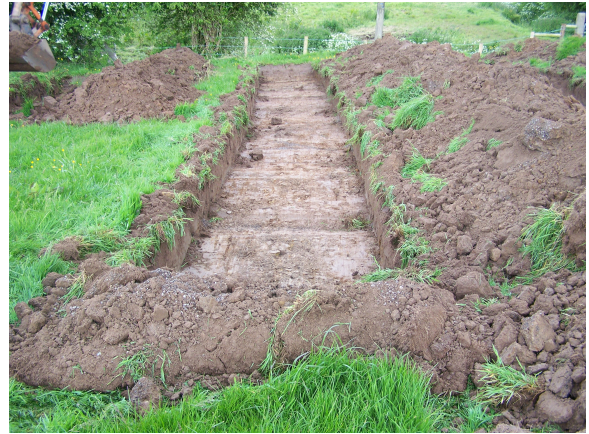
Plate 2: Trench 2, looking west.