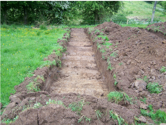
Plate 3: Trench 3, looking west.