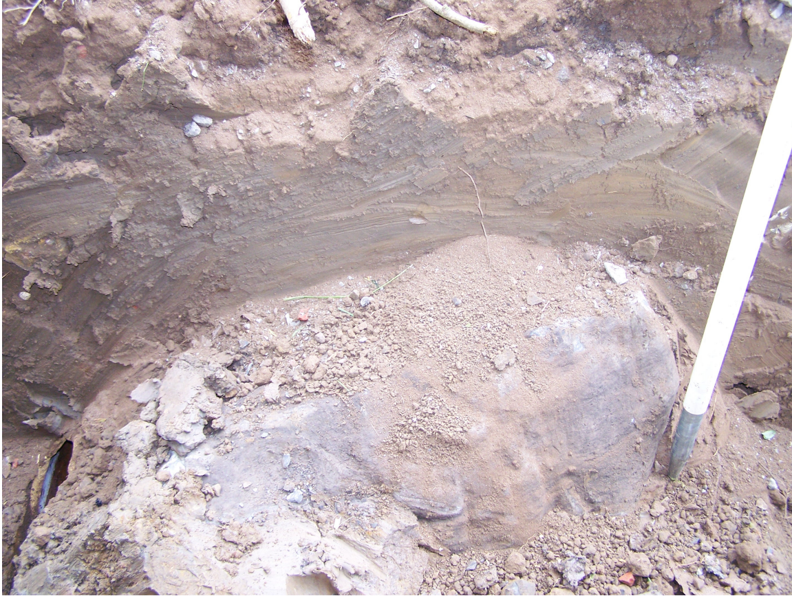
Plate 5 Showing the rock deposit (Context No. 109) on either side of the ceramic storm water pipe (visible to left of picture). Looking SE