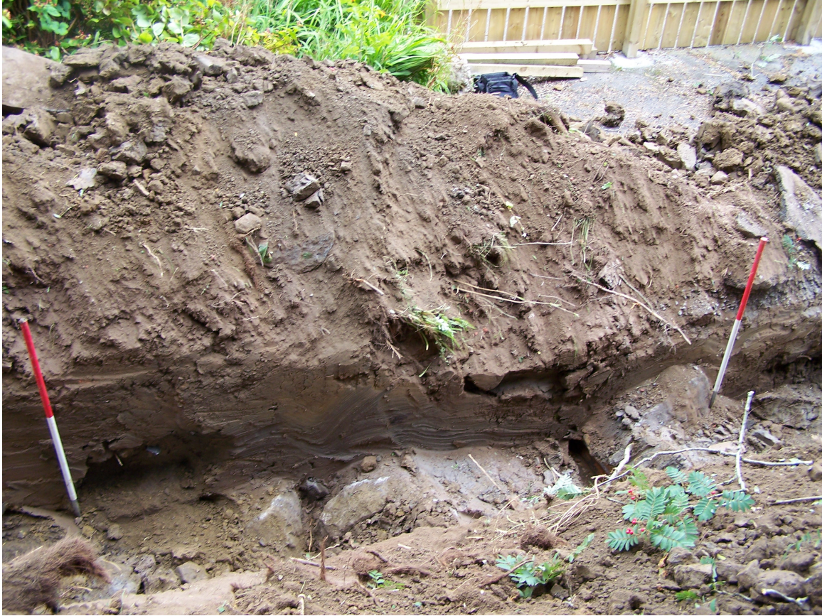
Plate 6 General shot of test trench indicating the slope on site. Furthest extent of the rock deposit (Context No. 109) is indicated by the ranging rod to the right of picture. Looking SE.