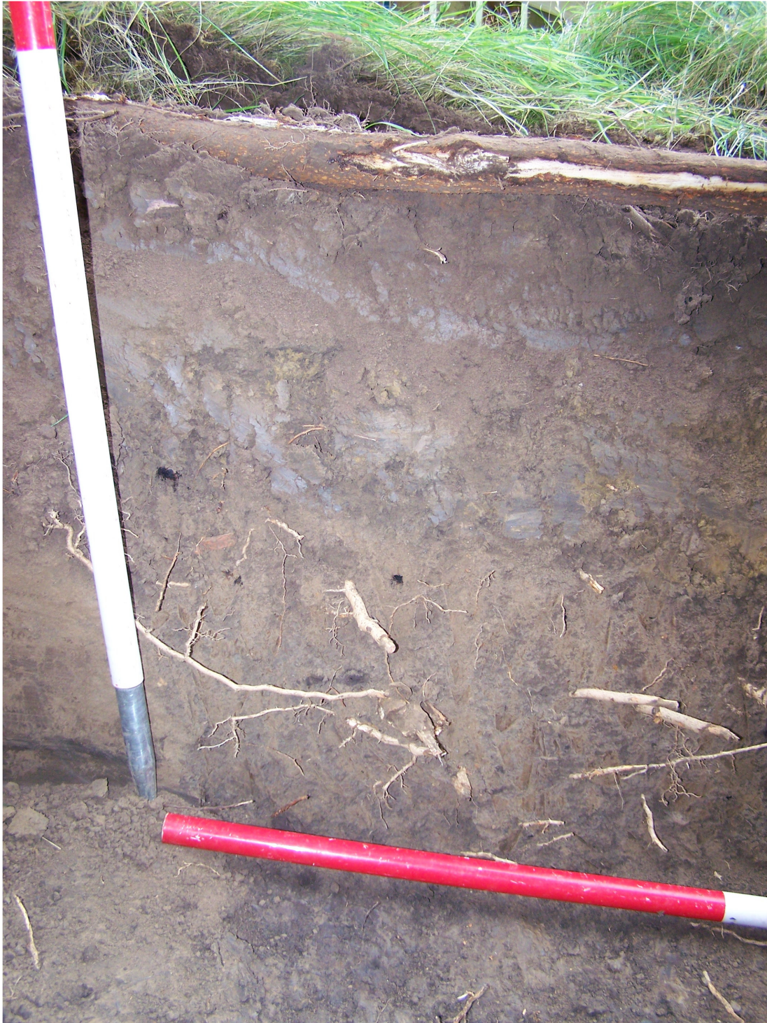
Plate 3 Section shot at NE end of test trench, showing the thin dark grey clay layers (Context Nos. 103 and 105), acting as stabilizing deposits for the brown loam layer (Context No. 104). Looking SE.