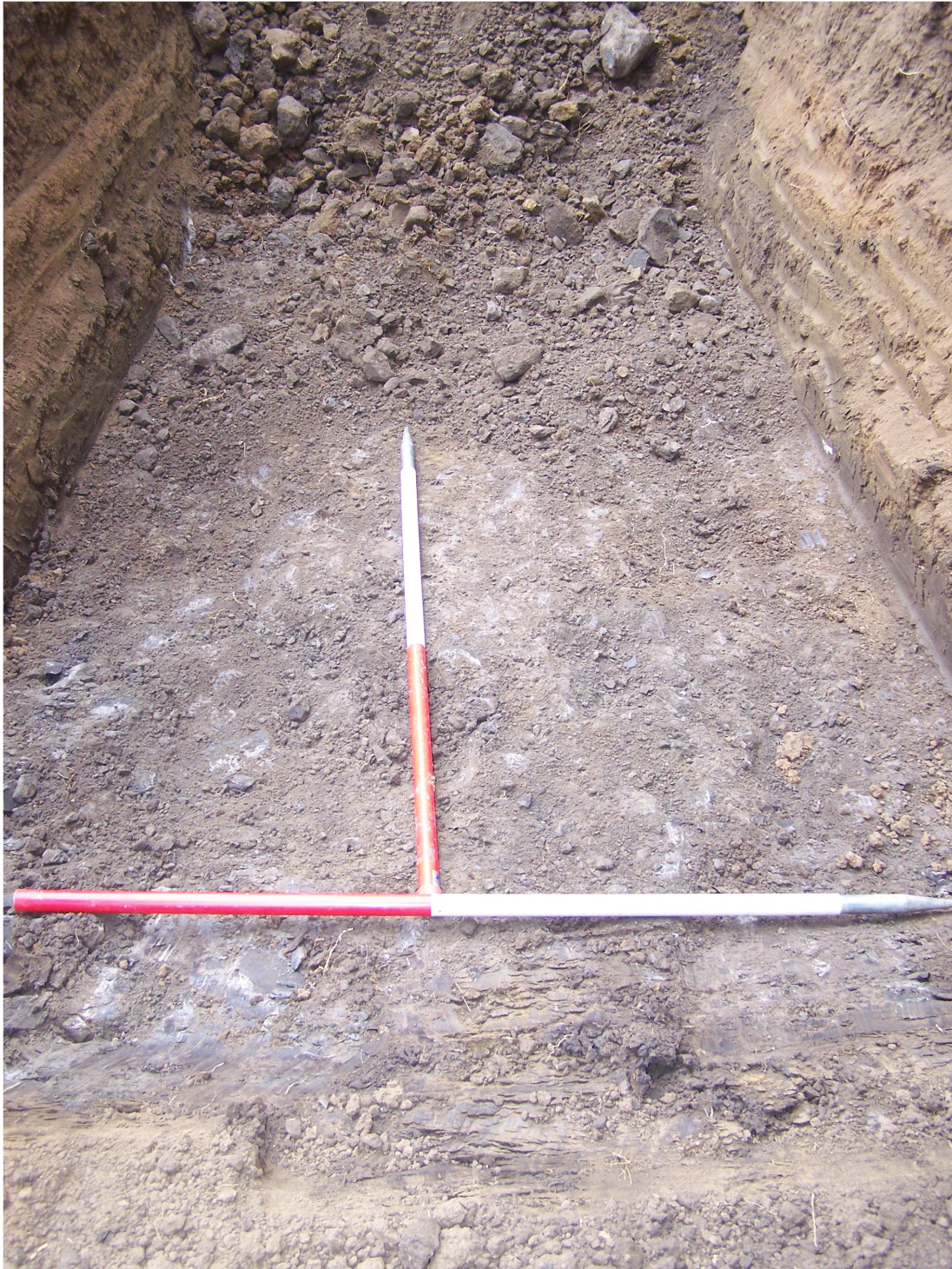
Plate 4 Showing the light grey clay deposit (Context No.108) revealed at the break of slope. Looking SW.