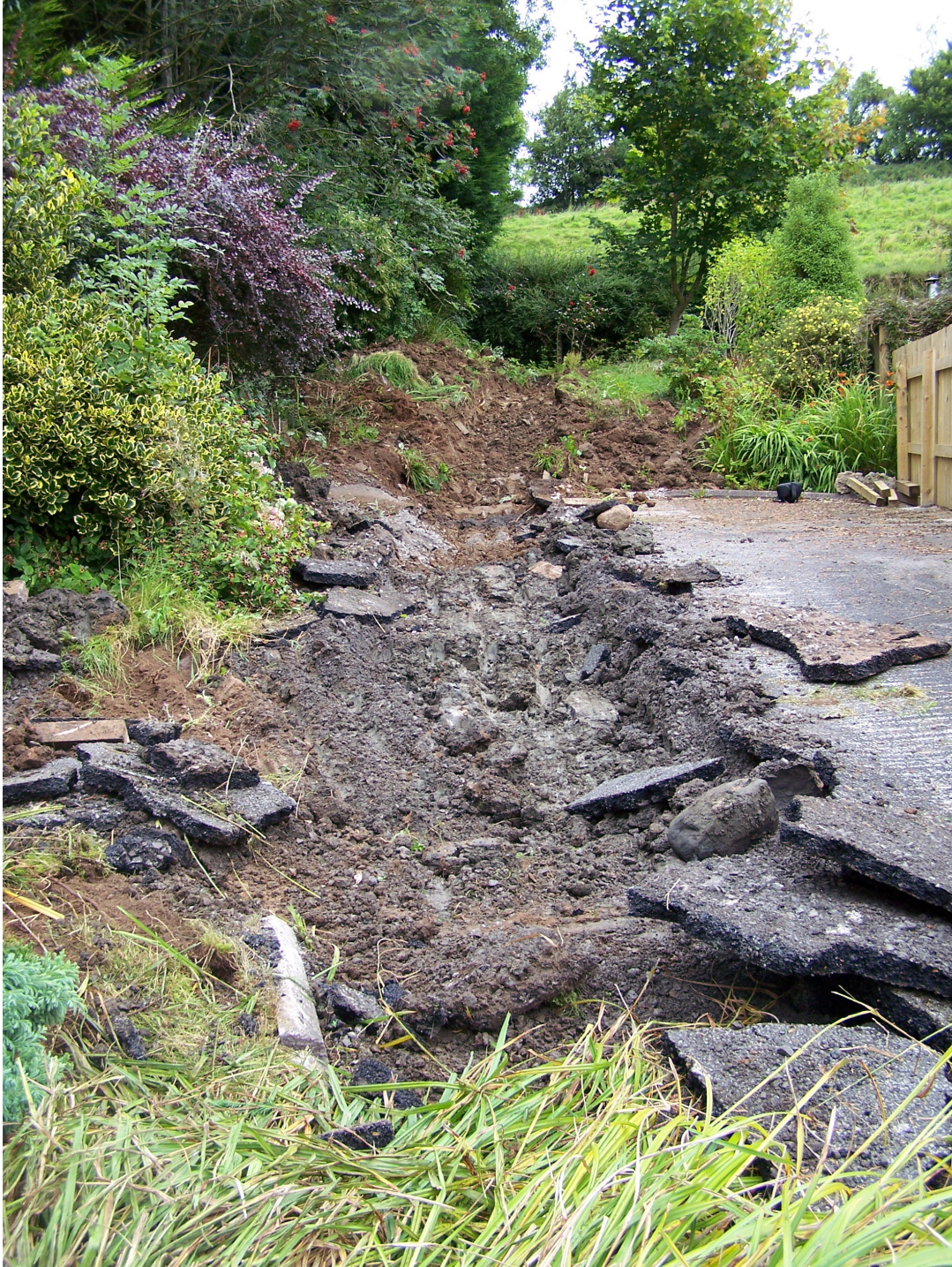
Plate 1 General shot of the proposed development site showing the concrete and tarmac covering to the SW area of the test trench area. Looking NE.