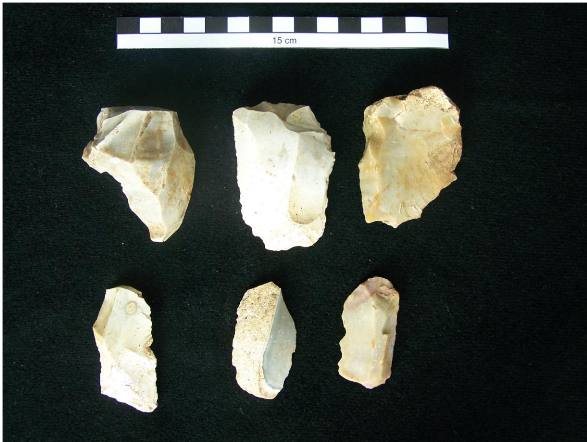
Plate Five: Sample of lithic artefacts recovered during the evaluation. The upper left piece is a core that exhibits bi-polar reduction (crushing on both the proximal and distal ends of the flake scars). It is thought that this is a characteristic Bronze Age reduction strategy. The other artefacts are less diagnostic retouched flakes and probable end-scrapers.