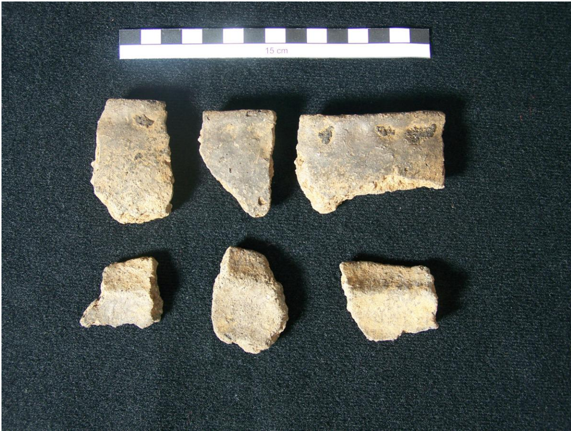
Plate Four: Sample of Late Bronze Age pottery sherds recovered from the burning in Trenches One and Two (Context Nos. 103 and 203). At least two types of vessels are represented; the top row are sherds of 'flat rim ware' of Haughey's Fort type (Jim Mallory pers comm. ). The bottom row are sherds from a vessel that has an internal bevel (again of Late Bronze Age type).