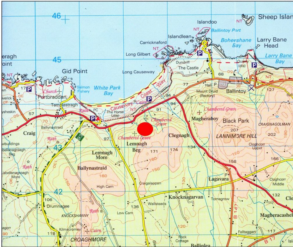
Figure One: General map showing development site (red dot)