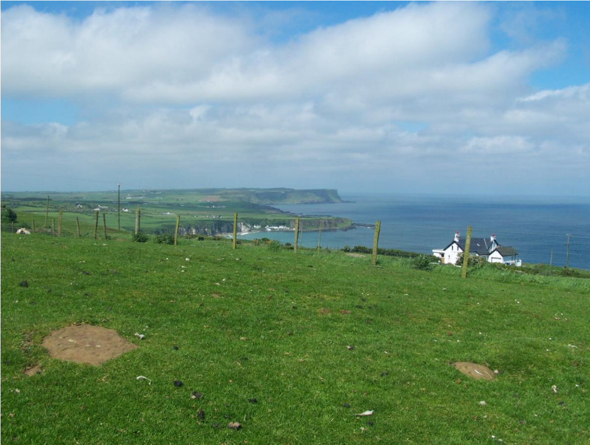
Plate One: Application site prior to the evaluation, looking north-west.