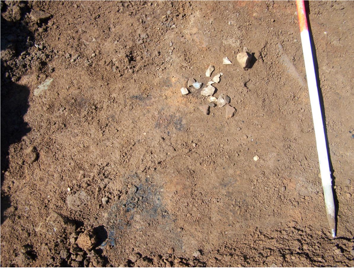
Plate 2: Burning encountered in Trench One (Context No. 103) looking north.