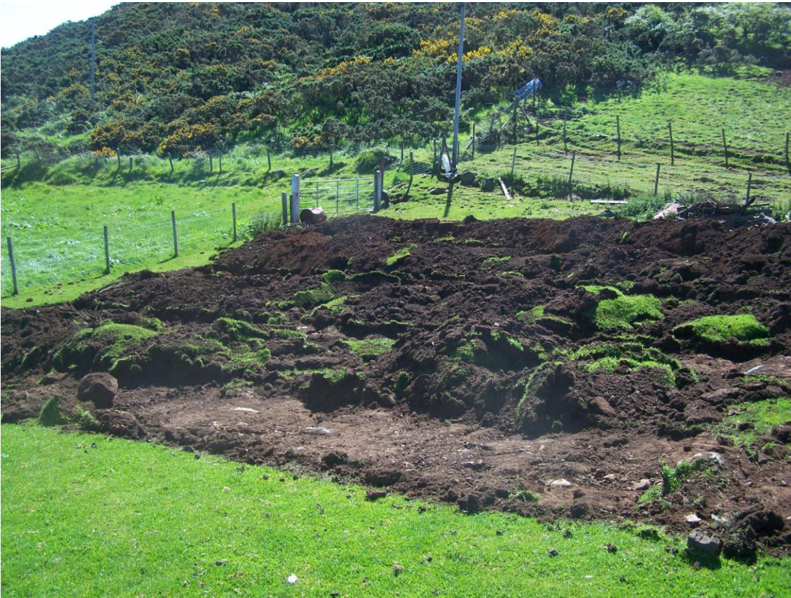
Plate Three: The development site following the evaluation, looking south-east.