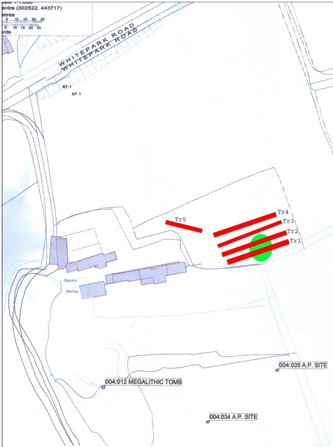
Figure Three: Detailed map showing location of the test trenches (in red) as well as the approximate location of the archaeologically significant deposits (in green). This area is highlighted as it was here that the concentration of pottery sherds and burning was encountered, however pottery and struck flint artefacts were recovered from the other test trenches as well, and it is assumed that the burning encountered in Trenches One and Two is not the only archaeological feature present onsite.