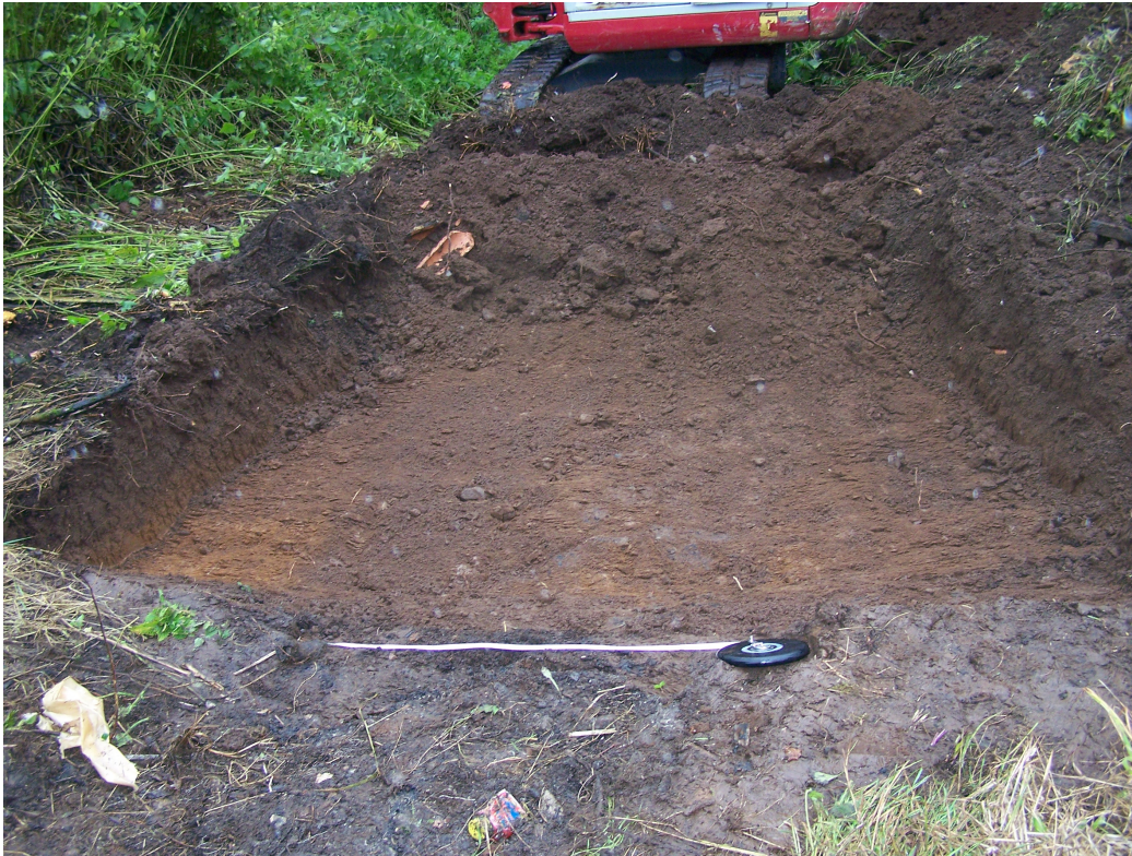
Plate Two: The trench following excavation to the surface of the natural subsoil (Context No. 102), looking north. (Scale is set at 1m).