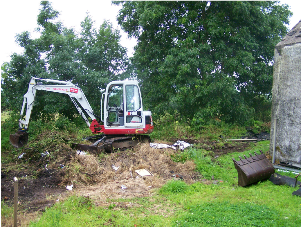
Plate One: Proposed area of the septic tank prior to the excavation, looking north.