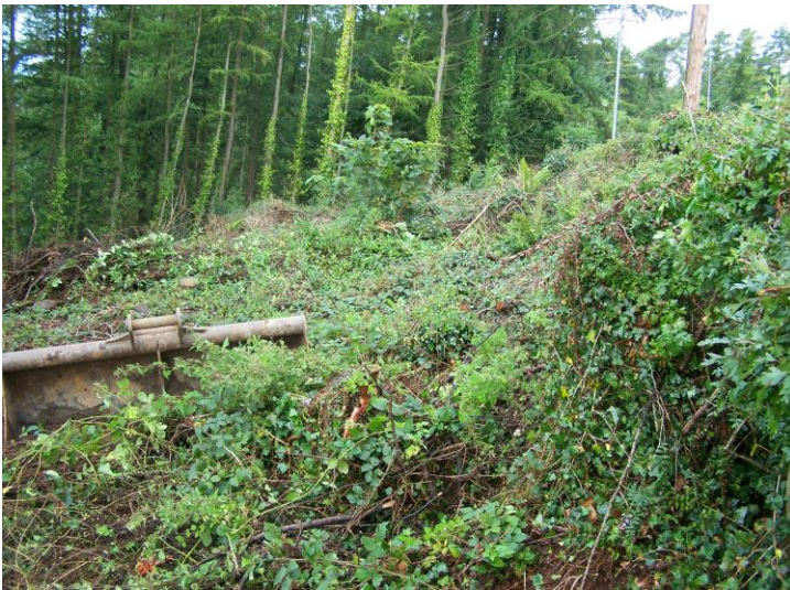
Plate 3: Vegetation cover over site prior to stump removal, looking west.