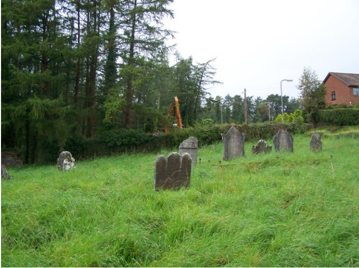
Plate 2: looking north-west from grave yard towards wall which divided it from the application site.