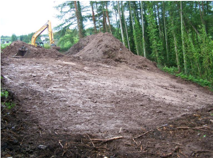
Plate 6: Site after topsoil stripping, looking south-east, (also showing spoil heap).