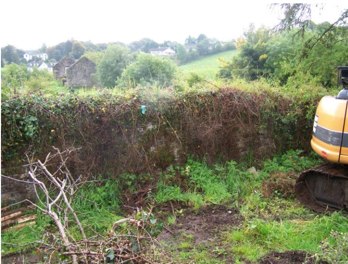
Plate 4: Church viewed from just inside application site, with wall dividing site from grave yard in foreground, looking c. south-east.