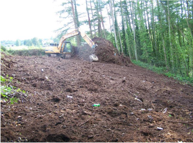
Plate 5: Site after removal of tree stumps and vegetation, looking south-east, (also showing spoil heap).