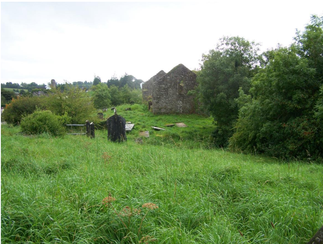
Plate 1: TYR 050:021, church and surrounding grave yard, looking south-east.