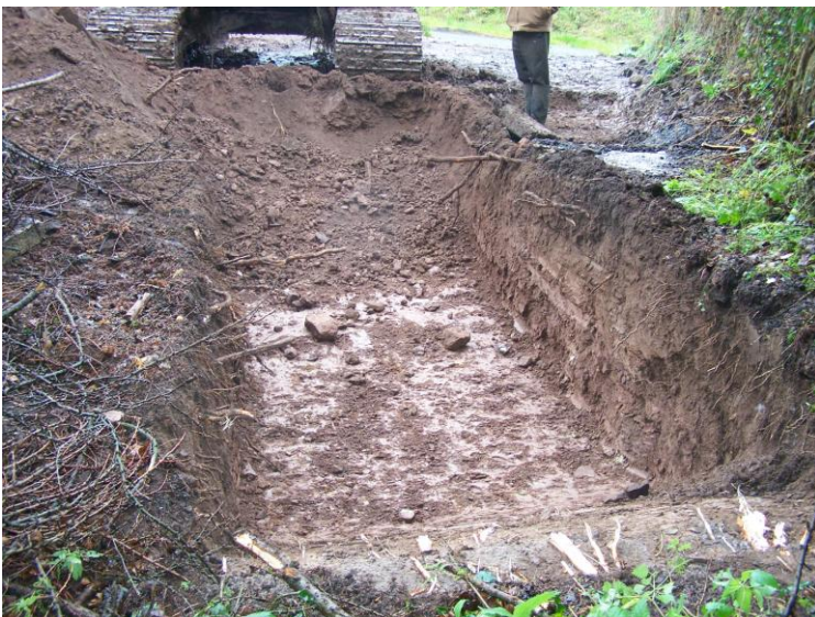
Plate 7: Test pit beside grave yard wall, looking north.