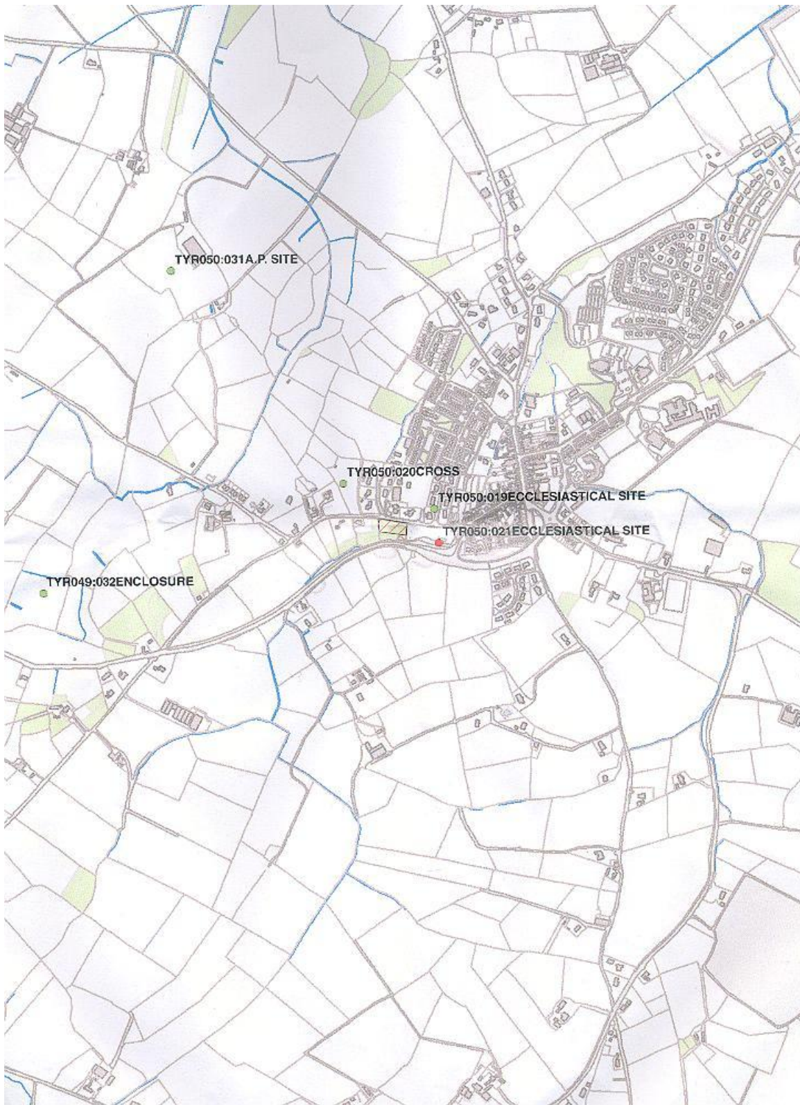
Figure 2: 1:10,000 map showing location of application site and archaeological sites in the immediate vicinity (Church denoted by the red dot).