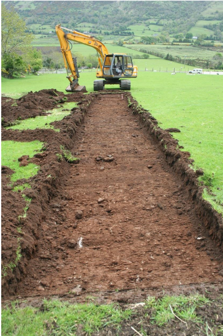
Plate 5: Test trench 3 (facing south east).