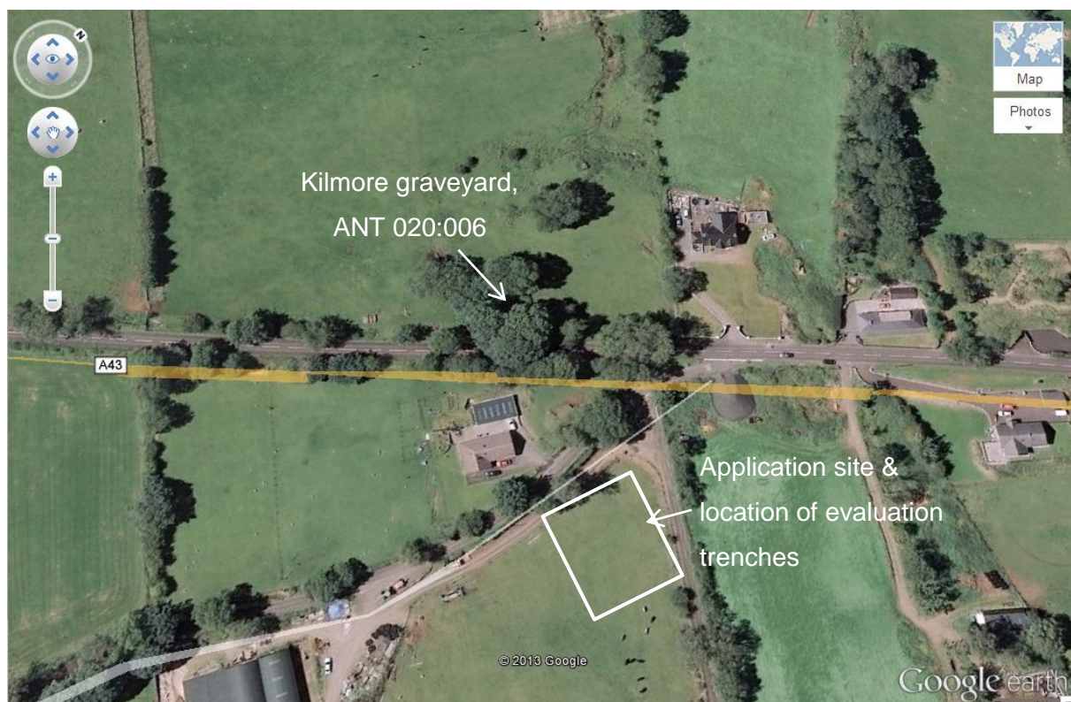
Figure 3 Google-Earth image showing the location of the application site in relation to the old graveyard at Kilmore (ANT 020:006) obscured by tree cover.