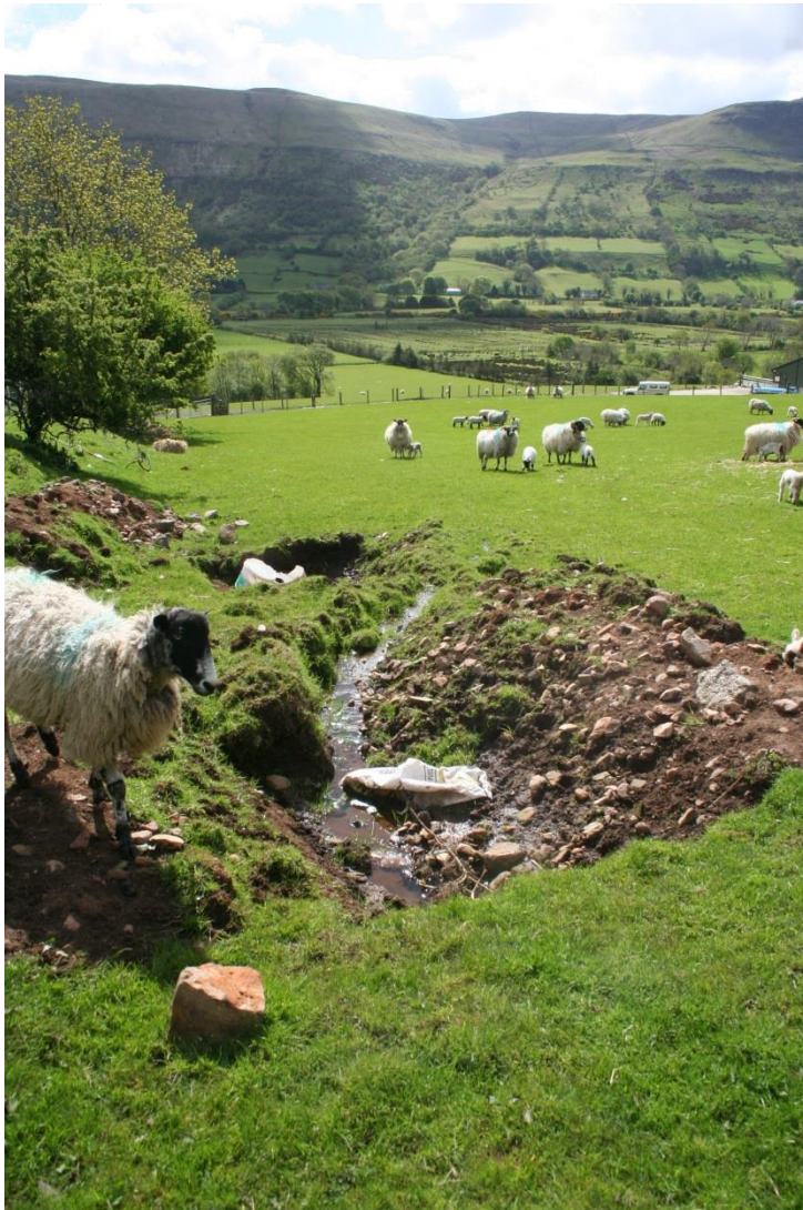
Plate 1: blocked field-drain at NE corner, partly dug-out (facing east-southeast).