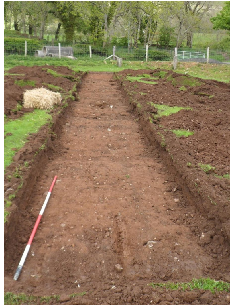
Plate 4: Test trench 2 (facing north west).