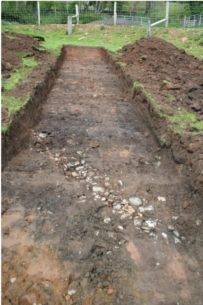
Plate 3: Trench 1 showing one of the field drains filled-in with cobbles and flint.