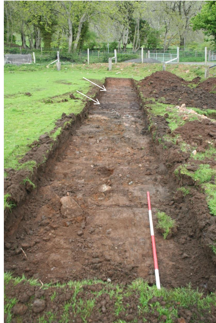
Plate 2: Test trench 1 (facing north-west) – the arrows mark the location of the field drains.