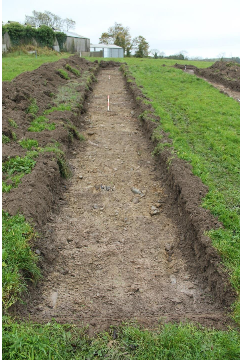
Plate 2: Trench 2, surface of the natural subsoil (c204), looking south-west