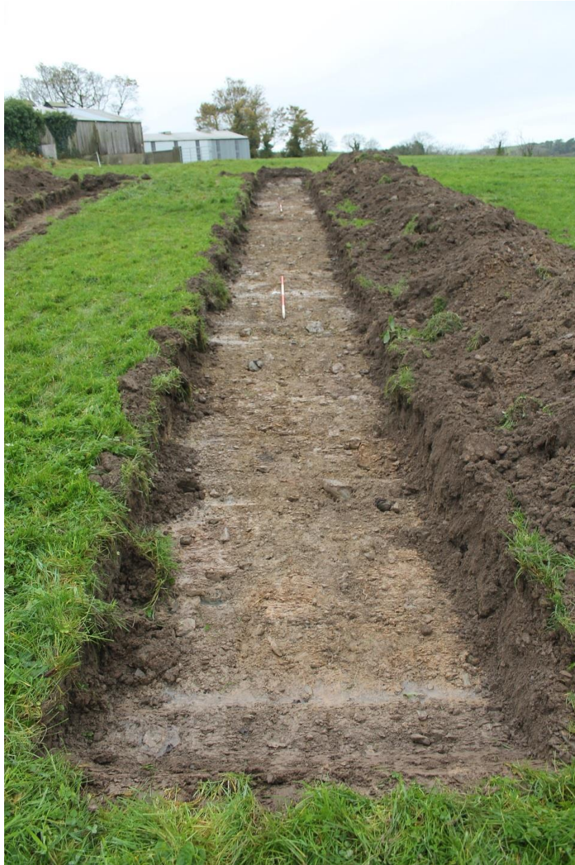
Plate 4: Trench 3, surface of the natural subsoil (c304), looking south-west