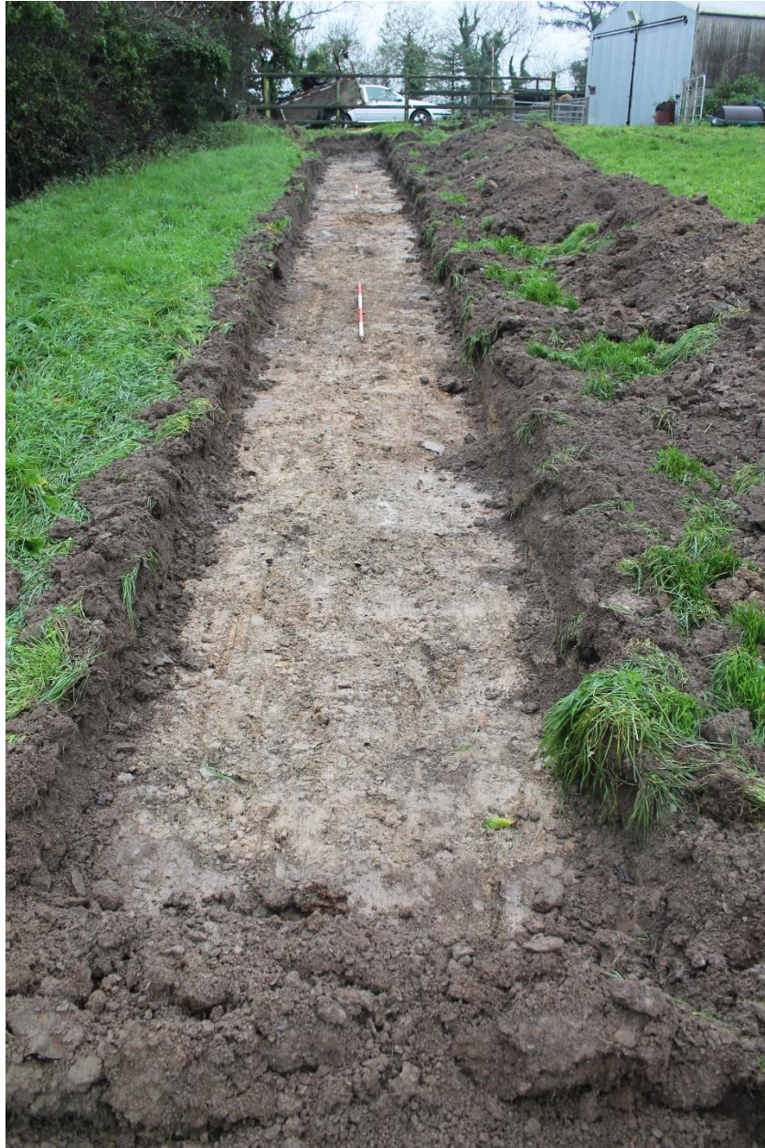
Plate 1: Trench 1, surface of natural subsoil (c102), looking south