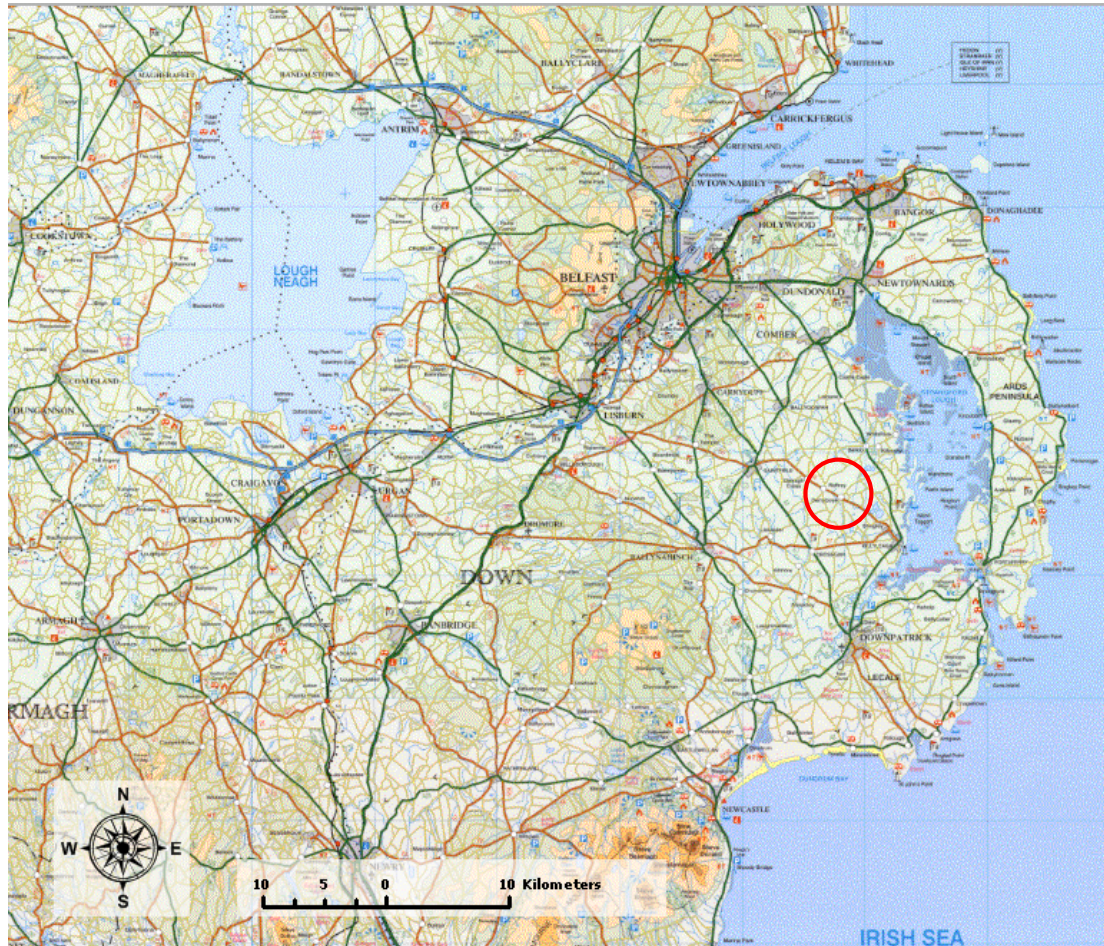
Figure 1: General location map with location of the site marked by the red circle