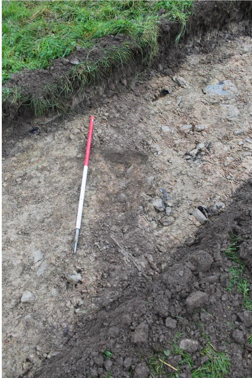
Plate 5: Trench 3, cut for linear (c303), looking south