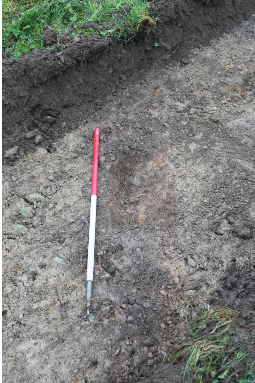
Plate 3: Trench 2, cut for linear (c203), looking north