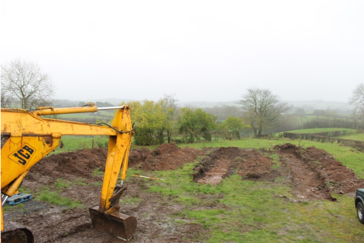
Plate 9 – General post excavation shot of Trenches One and Two (Trenches Three and Four are obscured by mechanical excavator)