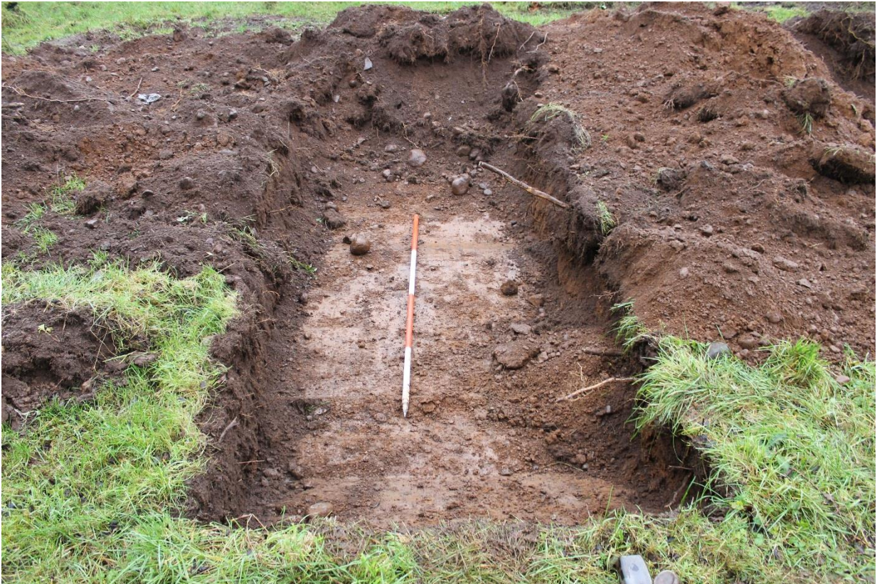
Plate 7 – Post excavation shot of Trench Six, looking south