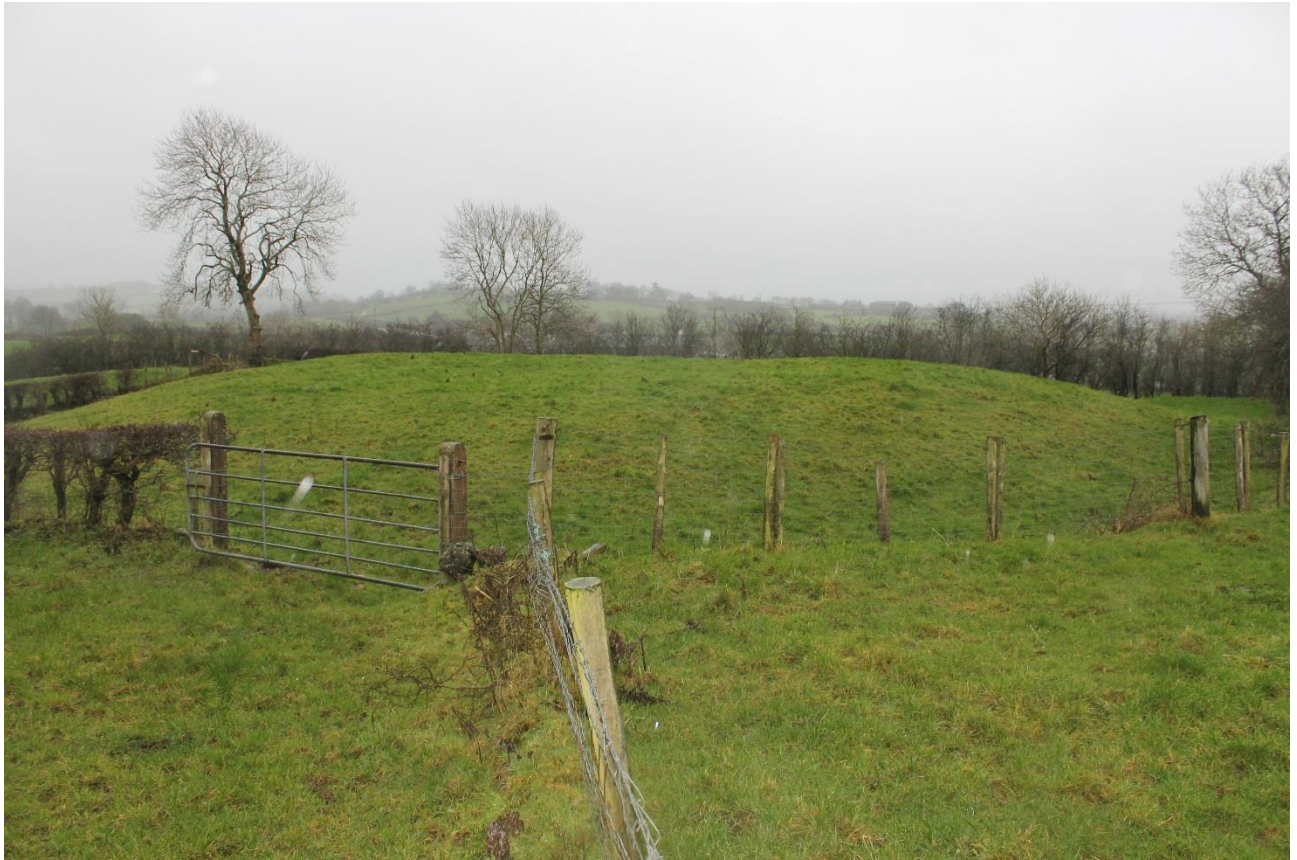
Plate 1 – Remains of raised rath adjacent to development site