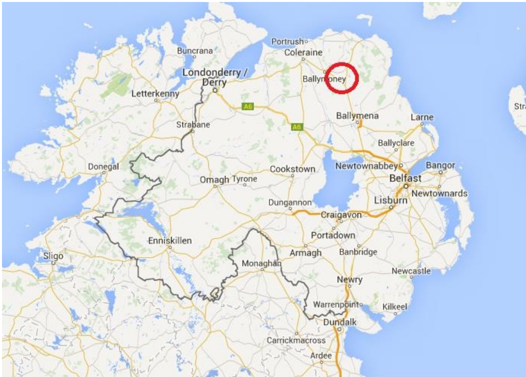
Figure 1 – General Location Map (circled in red)