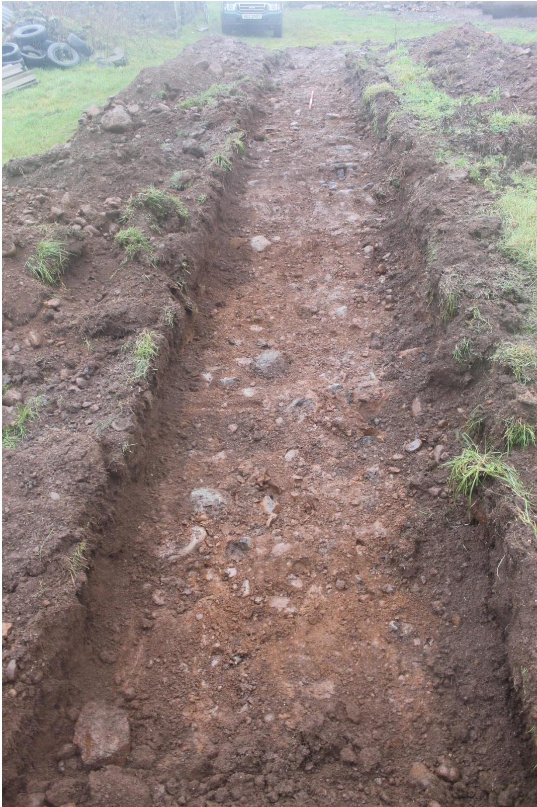
Plate 2 – Post excavation shot of Trench One, looking north