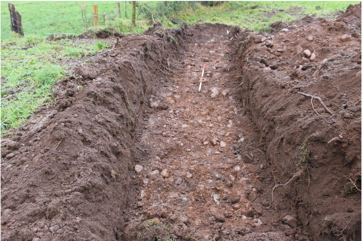
Plate 5 – Post excavation shot of Trench Four, looking south