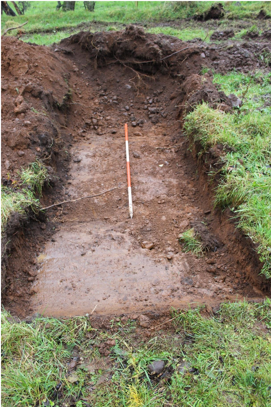
Plate 6 – Post excavation shot of Trench Five, looking south