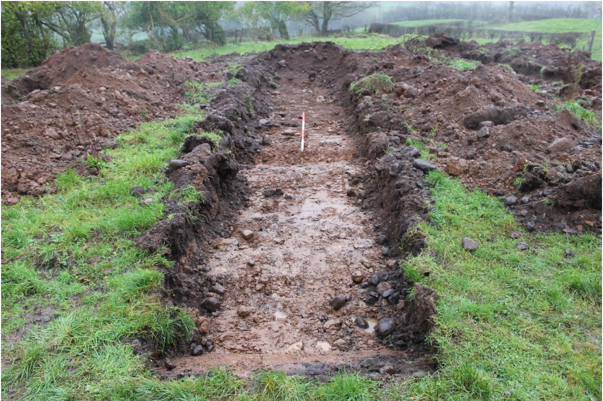
Plate 3 – Post excavation shot of Trench Two, looking south