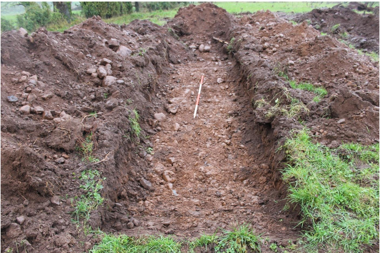
Plate 4 – Post excavation shot of Trench Three, looking south