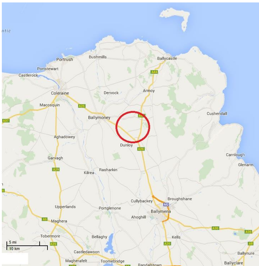
Figure 2 – General Location Map (circled in red)