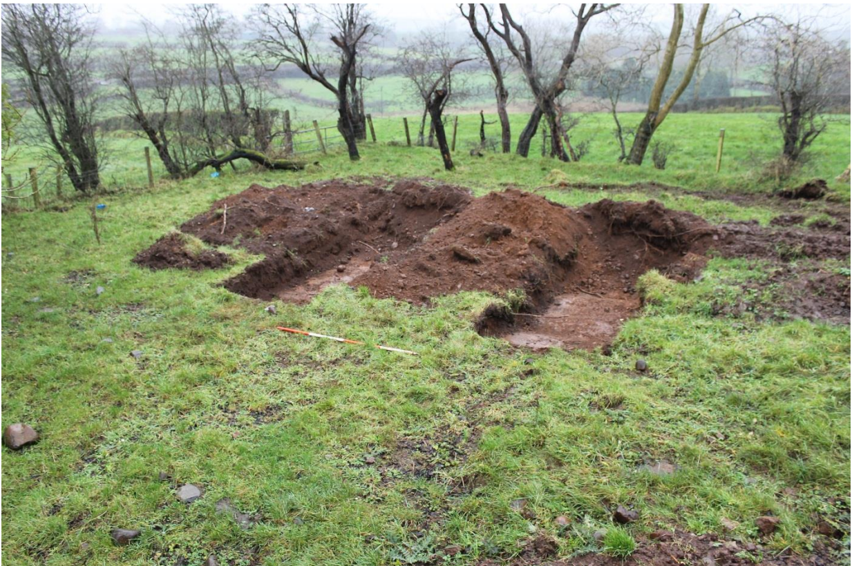
Plate 8 – General post excavation shot of Trenches Five and Six